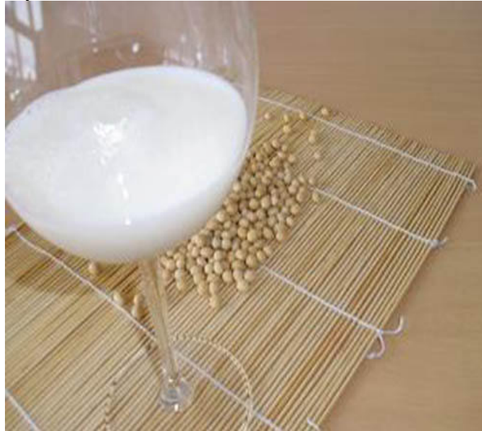
Figure 2: Soybean seeds and milk

The milk of animals that grow rapidly, such as cows, which double their birth weight in 50 days, is rich in protein and minerals; composed of 80 percent water, 5 percent fat, characteristic taste and texture, vitamins A, D, E, and K, as well as certain fatty acids. It contains many minerals, the most abundant of which are calcium and phosphorus and an excellent source of vitamins A and B 2 . Vitamin A, is found in the globules of fat and is removed when fat is skimmed away to make low-fat or skim milk.