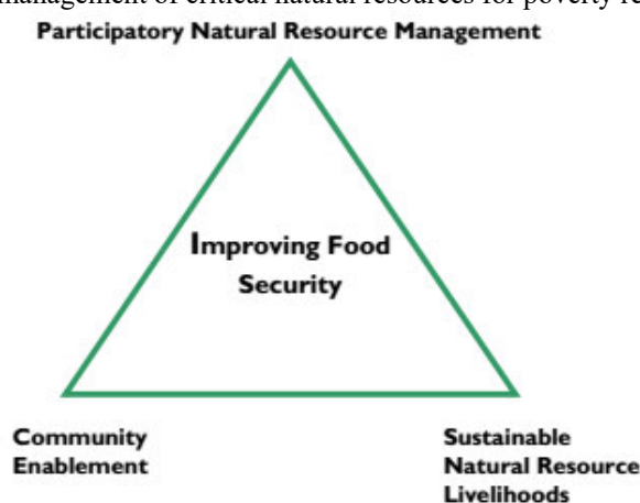
Figure 3: Participatory natural resource management food security

Bale Forest Enterprise (BFE) and Bale Eco-Region Sustainable Management program (BERSMP) were aimed to stabilize and improve the food security situation of the Bale area based on the three pillar approaches: Community based Participatory Natural Resource Management; Community Enablement; and Sustainable Natural Resource based Livelihoods (Figure 3). In this case BFE and BERSMP made progress in rural livelihoods and natural resource conservation. Involving local people and their institutions in the management of natural resources has been identified as one of the most appropriate approaches to sustainable development. Thus, the program focuses on community level management of critical natural resources for poverty reduction.