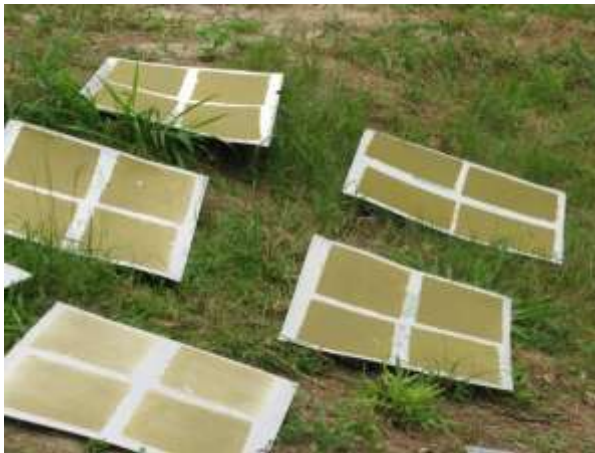
Fig. 3: The fibre left to drain off in the basket. Fig 4: Open air drying (note the use of disused Photo printing plates)