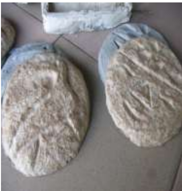
Fig.7: (a) Paper sculpture from moulds.