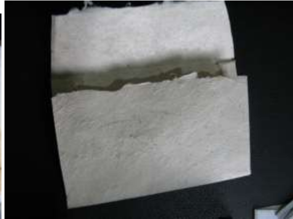
Fig 10: Book sewing from hand made paper