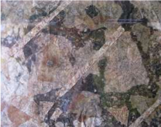
Fig. 5: An artistic collage piece untitled made with the paper