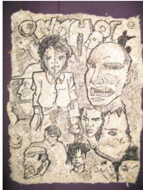
Fig 6: A work on the paper as a support