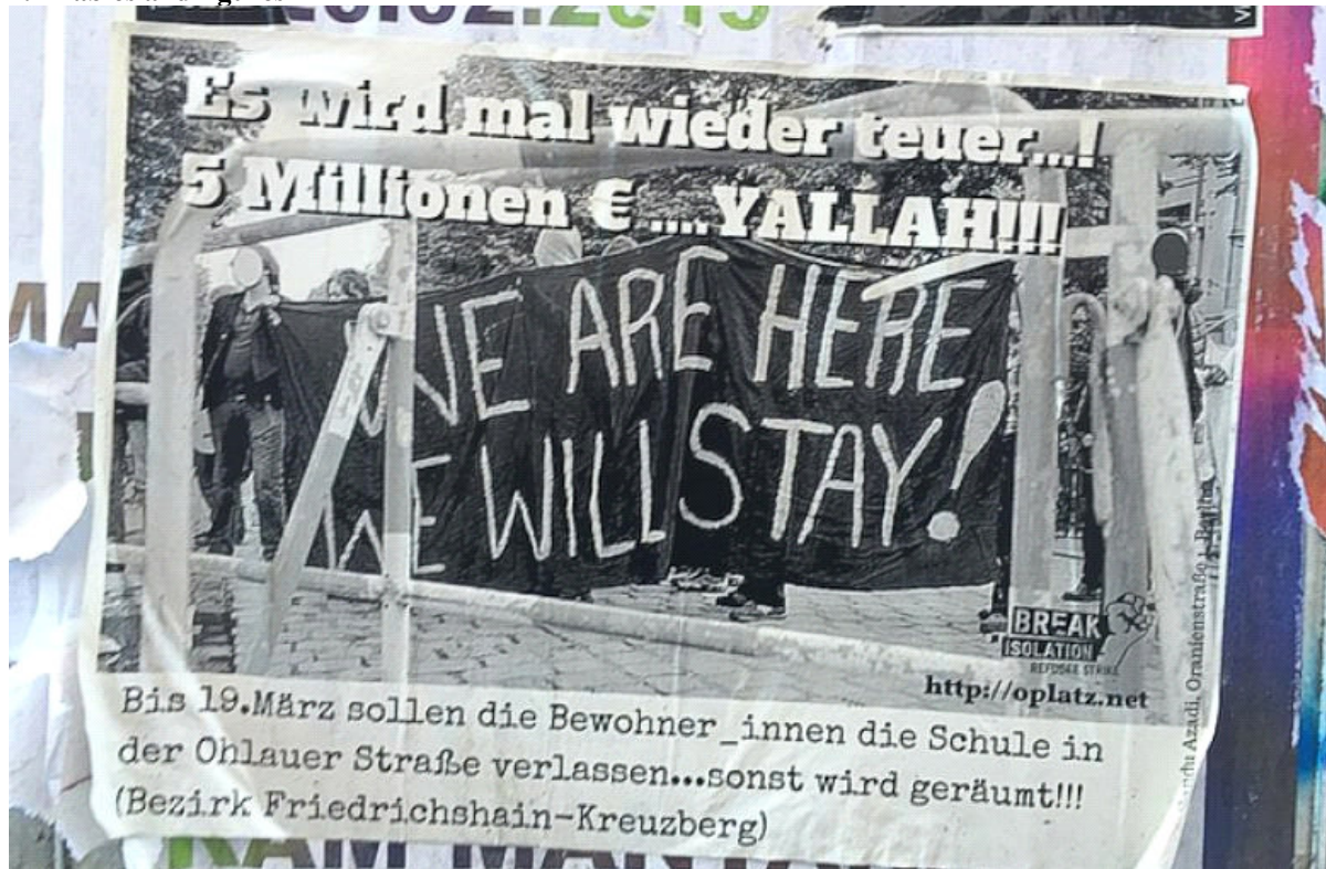
Pro-migrant flyer. Berlin, 4 April.