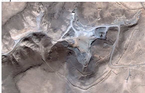
Figure 1 the presumed nuclear base of al-KIBAR in northeastern Syria

The security department of the Office of the State Comptroller tracked in 2007 the process of detonating the nuclear reactor, in real time, from the decision-making process in the "depositors" until the destruction of the reactor in Syria. In a very confidential report submitted to the then prime minister Olmert, In the work of the Israeli intelligence services who were assigned to reveal the nuclear reactor, and the result was "a strategic surprise