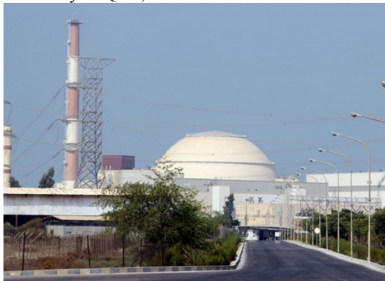
Figure 2 Bushehr nuclear reactor

In the city of Qom, there is an Iranian nuclear site to enrich uranium.