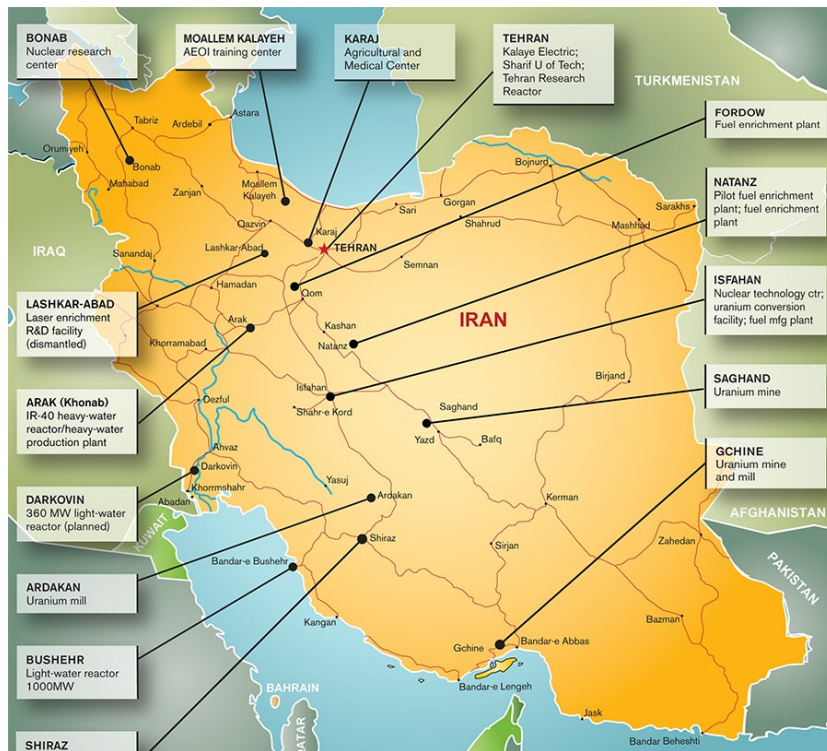
Figure5 The map developed by the Belfer American Center for Science and Security and Military Affairs of the most important sites of Iranian nuclear, which will certainly be accompanied by the US military and the Israelis or others in the event of a determination to launch a preemptive strike of the Iranian nuclear program