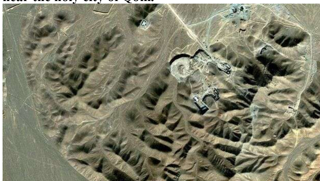
Figure 4 In January 2012, Iran said it had begun enriching uranium at its heavily guarded Fordo facility, near the holy city of Qom.

Arak reactor for heavy water research and commensurate with the production of depleted plutonium in the manufacture of nuclear weapons.