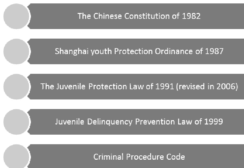
Figure 5. Laws Concerning Juveniles in China