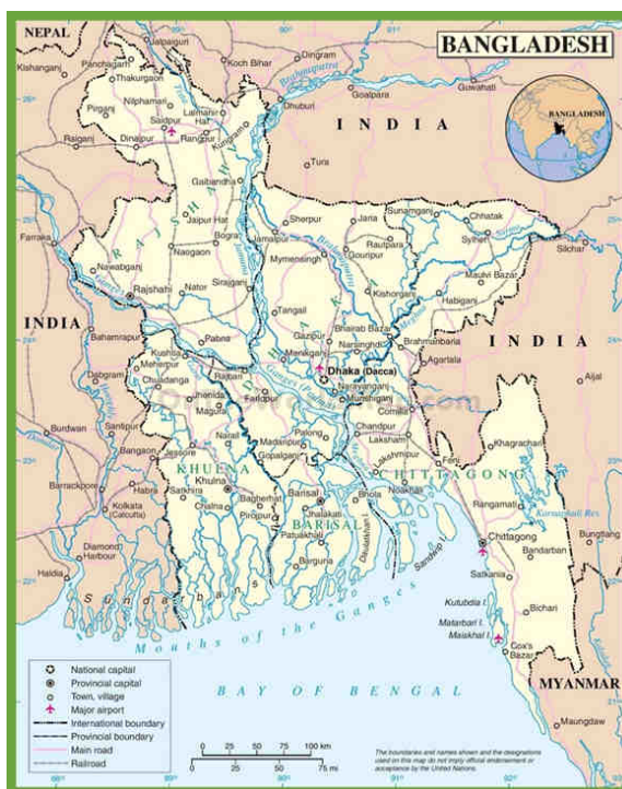
Figure 1. Political Map of Bangladesh

Bangladesh is a South Asian country located off the northern part of the Bay of Bengal, which is surrounded by India and a small border with Myanmar, by all other three parts. It is a unitary country and divided into 8 divisions. All of these divisions then divided into several districts and thus this country has 64 districts in total. Each district has several upazilas (subdistricts or police stations) (“Bangladesh,” 2018; Figure 1). At the present context, the number of recruitment of the children in different criminal activities in Bangladesh is in a rising trend. Street children or abandoned children are mostly vulnerable to organized criminals for engaging them in such heinous offences. Moreover, many children are under a serious threat of drug and sexual abuse because of their living in the slum areas. According to the Department of Narcotics Control, nearly 5,50,000 children are addicted to drugs and about 30% of them are involved in any criminal activities (Khan & Tipu, 2016).