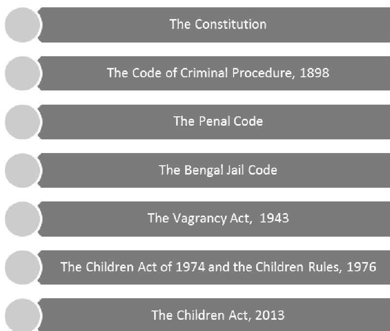
Figure 3. Laws dealing with child and Juveniles in Bangladesh

From the above discussion, it becomes clear that the juvenile justice system in Bangladesh has touched a landmark in Bangladesh at least in course of establishing a legal instrument keeping a good alignment with the international guidelines, i.e., UNCRC (Ferdousi, 2013; “The Children Act 2013,” 2013).