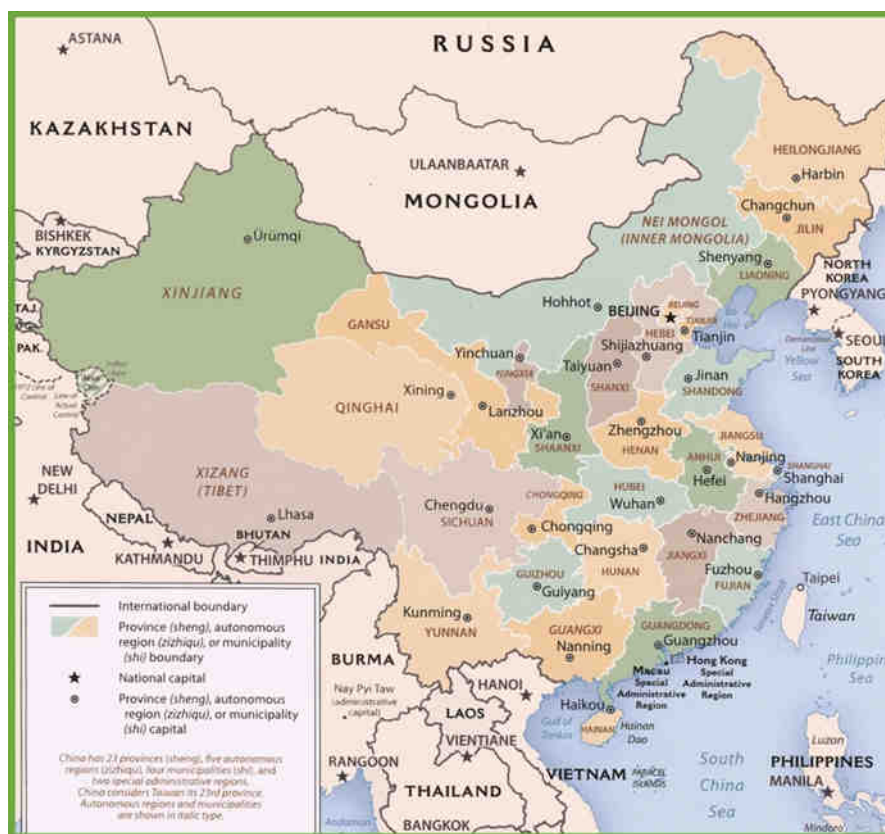
Figure 2. Political Map of China