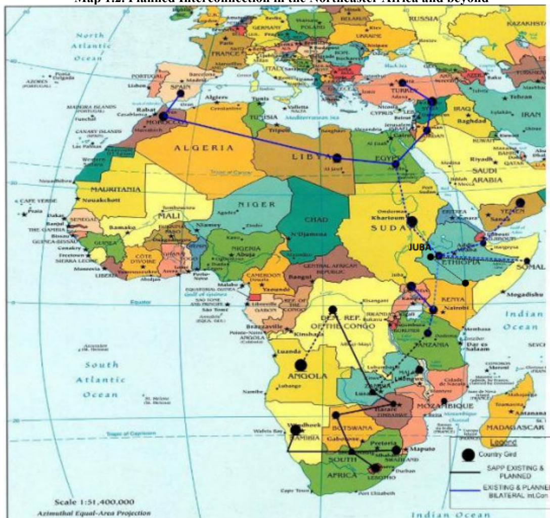
Map 1.2. Planned Interconnection in the Northeast Africa and beyond