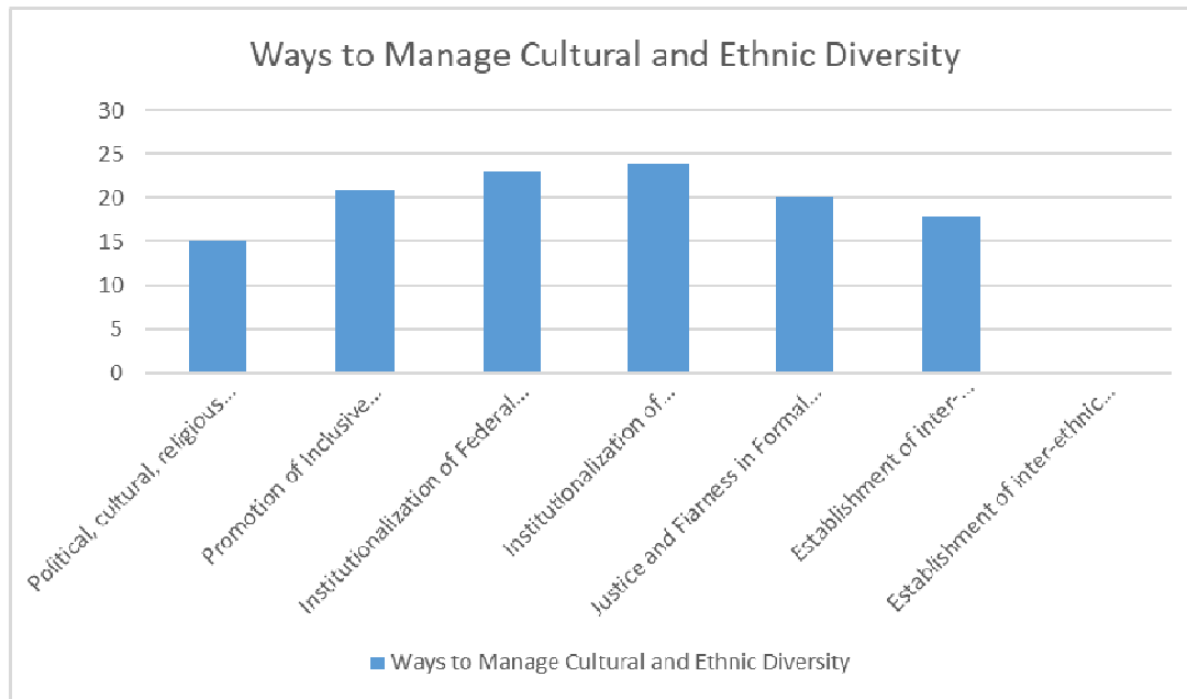
Fig 2: Ways to Manage Cultural and Ethnic Diversity

ethnic council, respect and tolerance of cultural differences, inter-governmental organizations and develop and adopt a legal framework for the role of traditional and religious authorities.