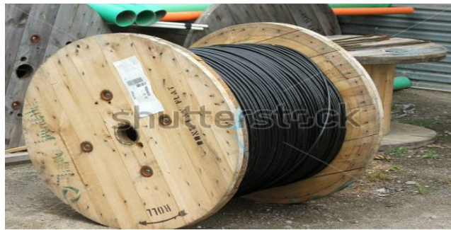
Storage of cable drum