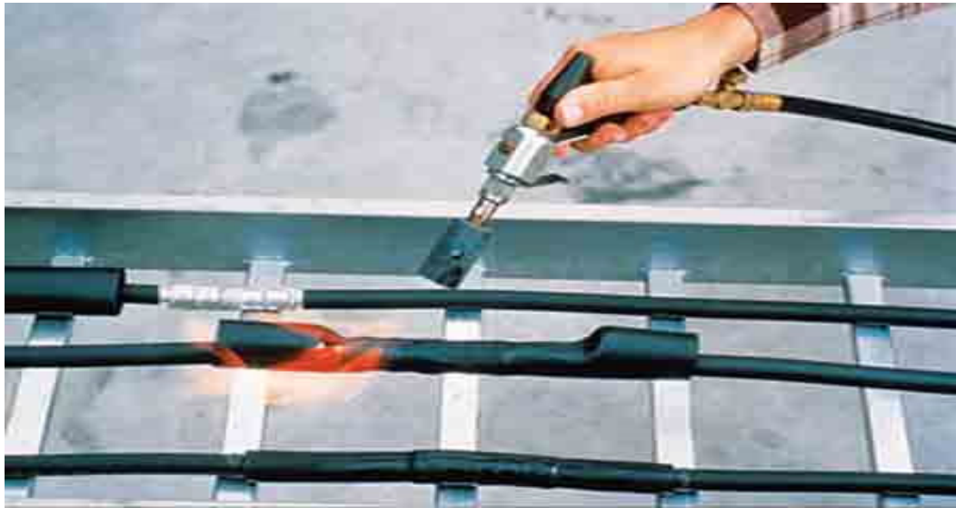
Heat shrink cable jointing