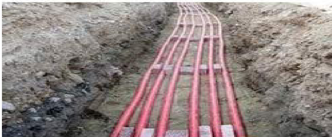
Cable laying in trench

Bending radius of steel/HDPE duct kept minimum 1.5 metre.