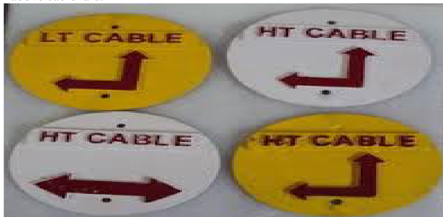
Cable route markers

GI/CI/Al plate on MS angle of 35mm x35mm x 6 mm of 600 mm length may be used for marker. It should be parallel to cable and kept at 300 mm from cable and at underground joints. Concrete markers can also be used and to be furnish above cable laid.