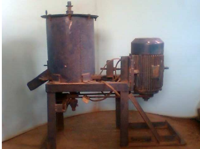
Figure 2: Polythene Recycling Machine

The diagram of the manufactured polythene recycling machine is presented in Figure 2.