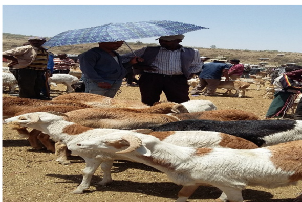
Figure 2: Sheep market at Adama

In the study area, livestock are generally traded by 'eye-ball' estimation. In some towns selling sheep by using live weight is also started. Live weight based shoat transaction is practiced in Adama markets. In eye ball based transaction, price is usually fixed by individual bargaining. Prices depend mainly on supply and demand, which is heavily influenced by the season of the year and the occurrence of religious and cultural festivals. During the time this study was conducted, the average price of sheep sold by eye ball estimation ranges from 1200-1600 birr for rams aged one and half year while the price of a kg live weight of sheep was 100 birr in Gefersa market.