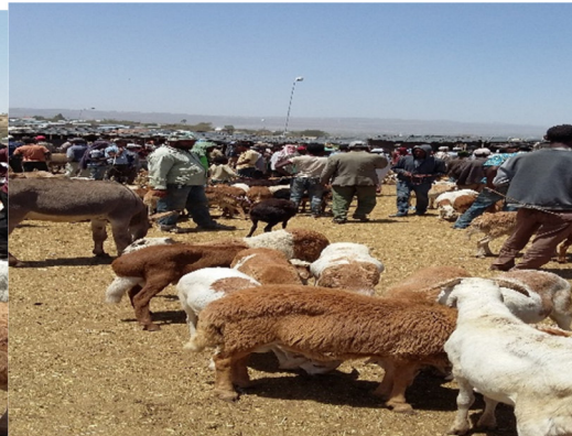
Figure: 3 Sheep market at Kurftu