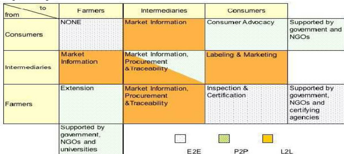
Figure 2: Matrix cells pair wise communication links

The matrix cells in figure 2 below represent specific pair wise communication links. L2L links are indicated in orange, P2P in green and E2E in white.