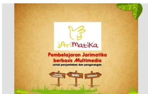
Figure 2 : The main design of jarimatika multimedia