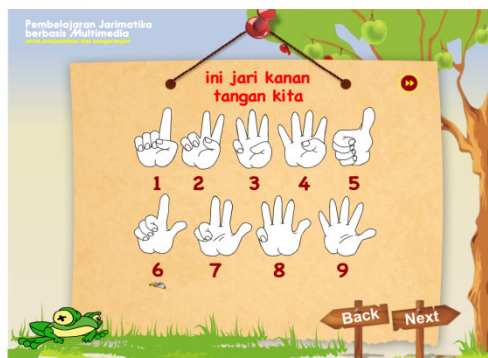
Figure 1 : Design layout of jarimatika Multimedia

activities and the learning of the students learning participants can quickly master how to read and intelligently know the colors that will be presented in this study, the process of how the motivation and desire of children to read, as well as follow-up research and learning to apply it on the capabilities and intelligence of children. The Graph 1 described that there was significantly increase of mathematic learning score categories between cycle 1 using konvensional learning method and cycle 2 using jarimatika multimedia learning.