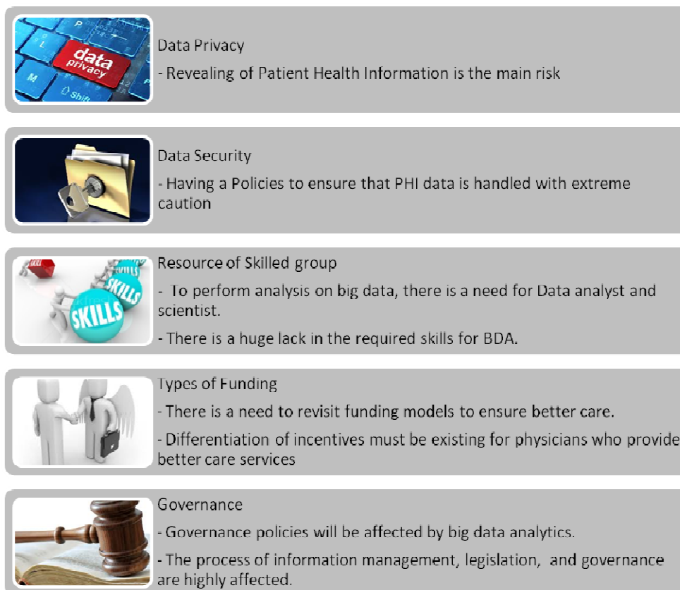
Figure 3. Another challenge of Big Data Analytics (source: Raj et al., 2015)

Big data therefore is a high velocity, variable data, complex that actually requires the different techniques and the technologies to help in capturing, storing, managing and distributing the information. The current techniques that have been present in the industry have been rather patient related in the healthcare and the medical data that shall be used to further understand the outcomes which can be applied at different points. The population data and the individual data shall be helpful in informing the patient during the process of decision making process (White, 2014).