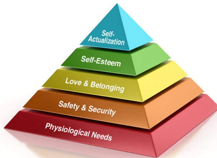
Figure 2: Maslow's Needs Pyramid

Apart from the incentives, no one can deny the importance of studying and addressing the cultural differences as a major factor that can impact the success in projects particularly IT projects. It normally contains team members from different countries and cultures with various backgrounds. Many IT companies rely on virtual team's model to provide different IT services and implement projects. Having an offshore hub of resources can help such IT companies to have various scales of experiences with less resources cost and prevent the cost of mobilizations.