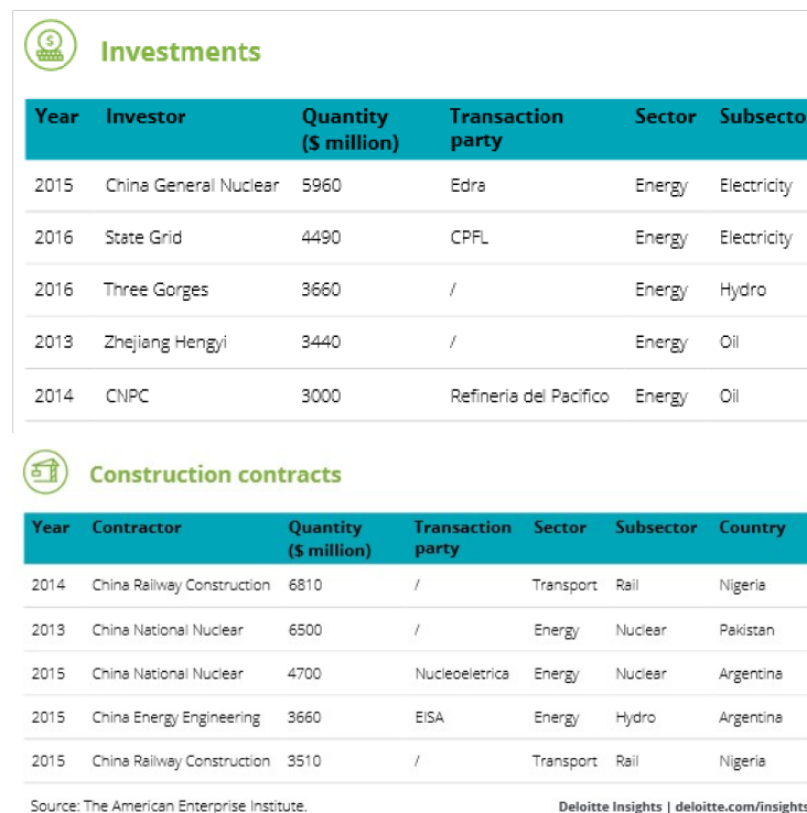
Table 3 source deloitte.com

involves reaching out to countries in Africa, Europe, America and other parts of Asia. Some of the majors projects implemented so far are: