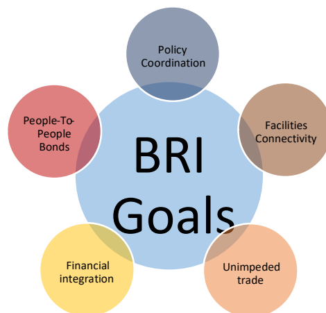
Figure 2 Objectives of Belt and road initiatives of China

Launched in 2013 as “one belt, one road” initiative (BRI), it involves China underwriting billions of dollars of infrastructure investment in countries along the old Silk Road. The ambition is immense. China is spending roughly $150billion a year in the 68 countries that have signed up to the scheme.