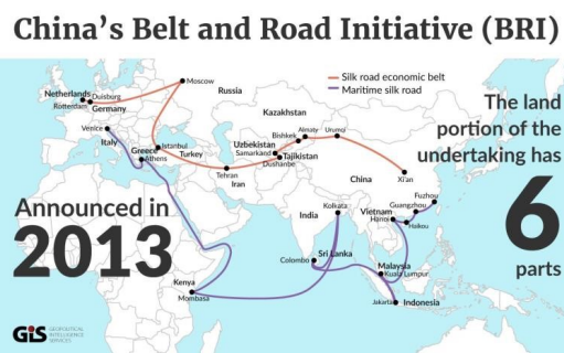
Figure 1 China Belt And Road Initiatives

Currently, since the “belt and road” of the People republic of china is ongoing, is it challenging to find empirical theory that can systematically show the effect of globalization and food security. Therefore, we rely on current implementation road map of “belt and road”, governments’ policies, previous research and books in the area of globalization and food security and make a qualitative analysis to deduce the relation between them.