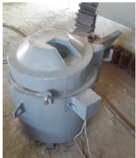
Plate 1: The painted salt bath furnace