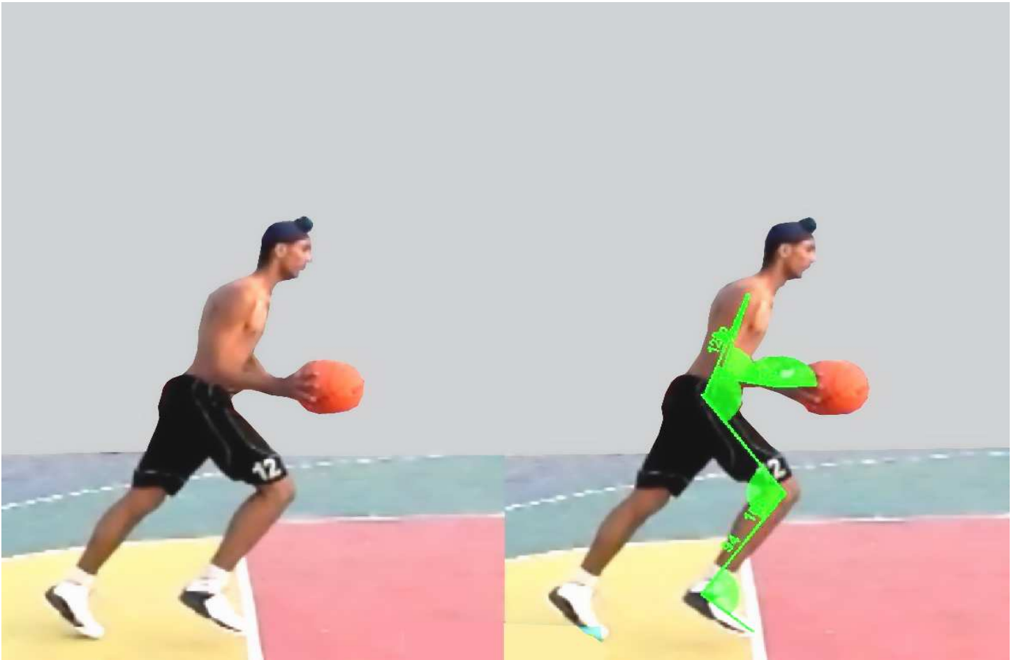
Figure 1. High Dribble at the Moment Preparation Phase

Wickstorm R. L., (1977). Fundamental Motor Pattern , (2 nd ed.). Philadelphia: Lea & Febiger.