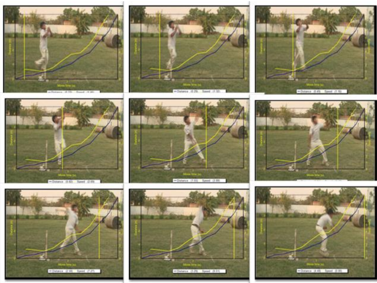
Figure 1 The basic bowling technique (right-hand bowler) has many characteristics: the run-up, leap, right foot contact, left arm motion, bowling arm rotation, left foot contact, ball release, and follow-through in respect to wrist linear velocity phase by phase.

For a straight bowling arm, ball velocity (BVe) can be considered to be the sum of the linear velocity of the shoulder (LVSh) plus the linear velocity of the wrist (LVWr) resulting from arm motion ( \dot{\phi}A_{Am} ) plus the linear velocity of the hand (LVh) as a result of hand flexion ( \dot{\phi}A_{Hf} ) (Figure 2). This analysis examines the changes to the LVwr component of ball speed as a result of elbow flexion. We assume changes to wrist speed would have the same effect on ball speed for both straight and flexed elbow deliveries.