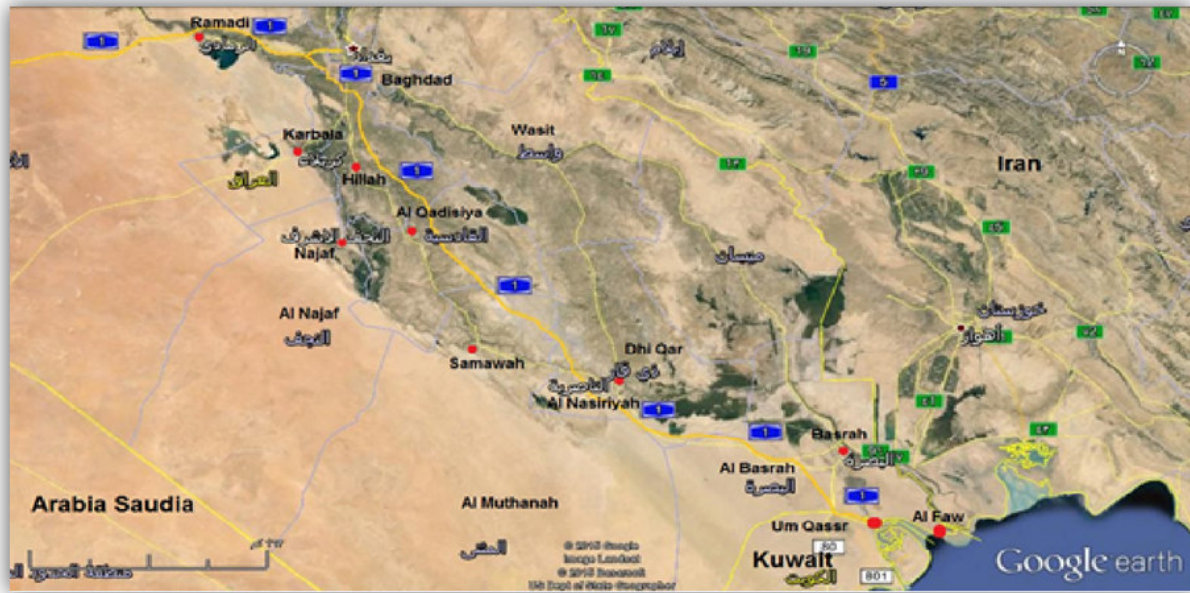
Fig.3 Expressway No.1 (Southern Section) Area Study