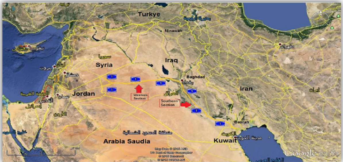
Fig.2 Expressway No.1 (Southern & Western) Sections