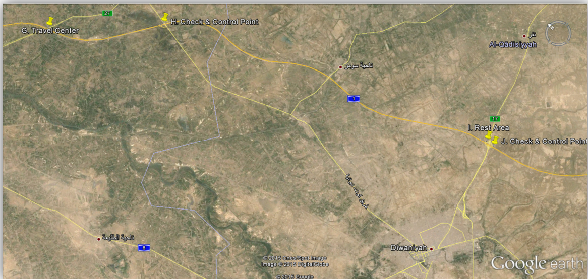
Fig.5; R5, Hilla City-Diwaniyah City Facilities Locations