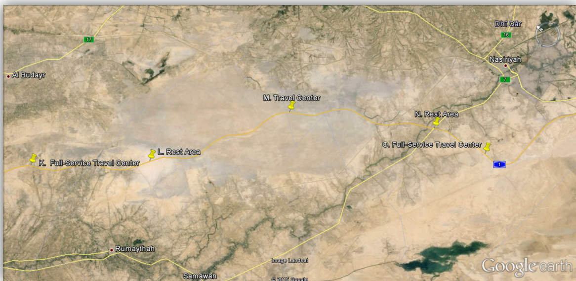
Fig.6; R6, Diwaniyah City-Nasiriyah City Facilities Locations