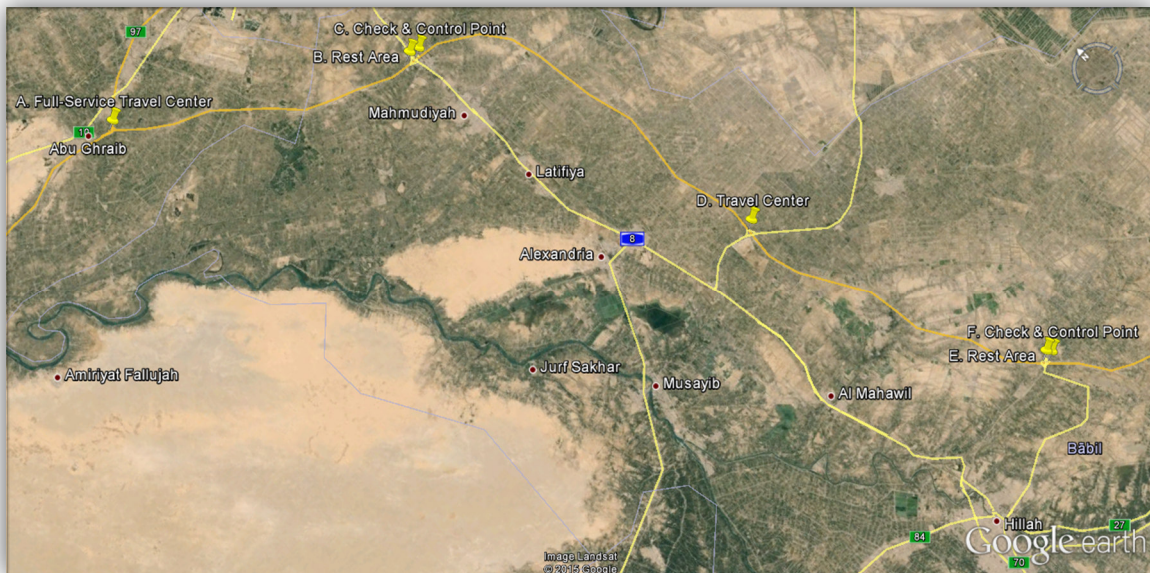
Fig.4; R4, Baghdad West- Hilla City Facilities Locations