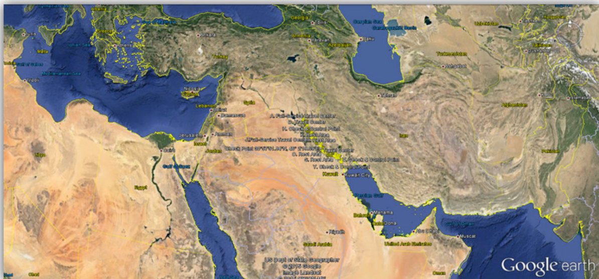
Fig.1; Iraq's Position in World Map

[14] Guide to EU Rules ON DRIVERS' HOURS REGULATION (EC) NO. 561/2006, Road Safety Authority, European Union Rules on Drivers Hours, RSA, 11 April 2007.