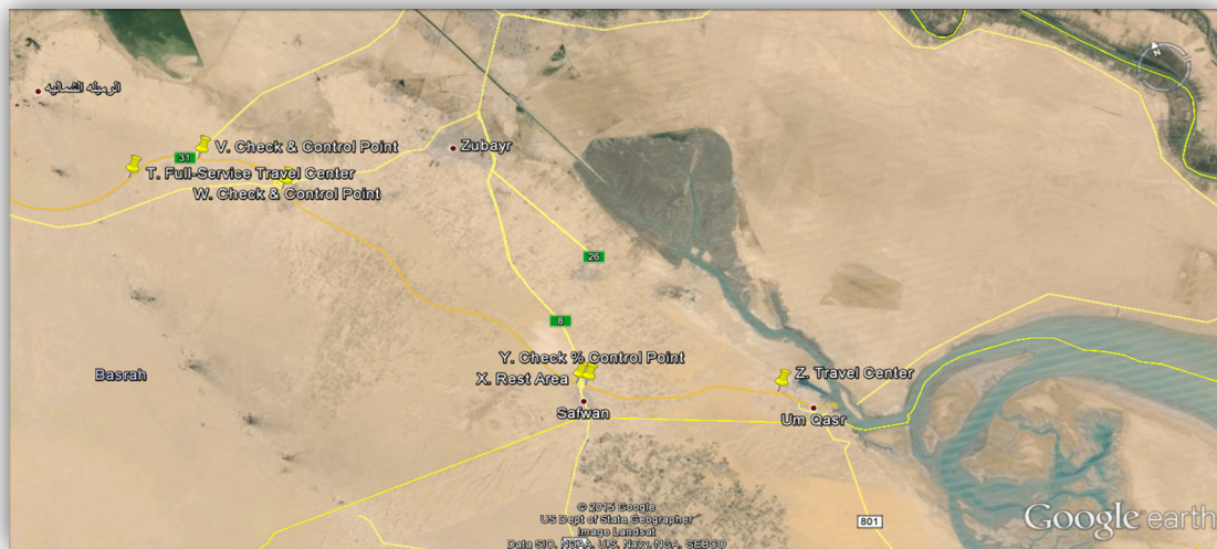
Fig.8; R8, Rumaila-Safwan Center Facilities Locations