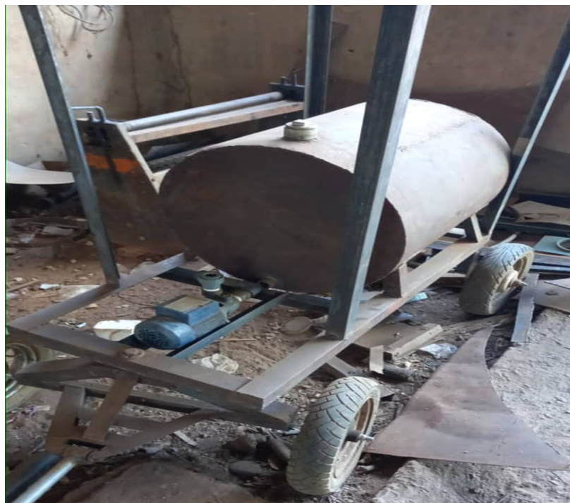
Figure 4.4: Front View Showing the Pump and Tank sections

For the fabrication of the water Sprinkler standard engineering methods involving Material Selection, Manufacturing Process Selection and Black Box Diagram were followed. Material used to be Mild Steel for the Lower Body (Base) and the rest from Brass. The manufacturing process involved is as shown in Table 1.