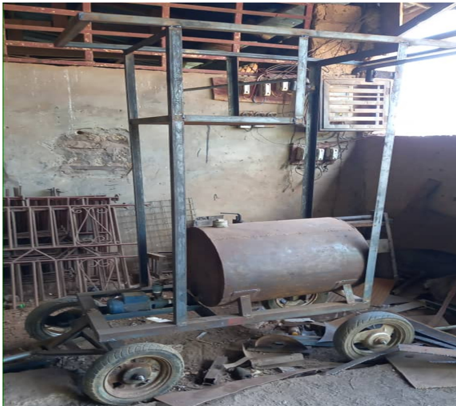
Figure 4.5: Extended Side View of the Hybrid Sprinkler System Under Fabrication