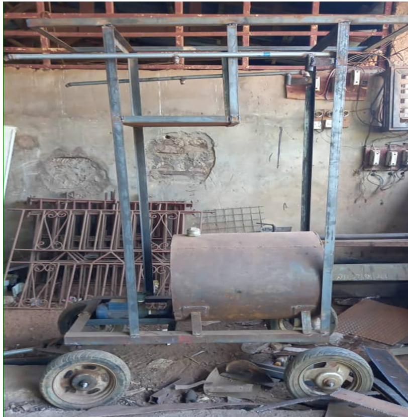
Figure4.3: Side View of the Hybrid Sprinkler System Under Fabrication