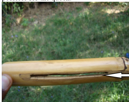
Hole through which workers feed Queen

They spray water, soil or throw cloth or leaf on the moving swarm; after it landed they catch the queen and put in the traditional queen cage, then put in the hive and stayed for few days; the cage have hole through which workers feed her according to their perception, the hole allow worker bees to freely inter the cage and exit but not possible for the queen.