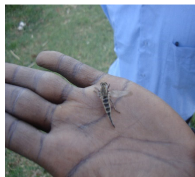
“ Adeera Kannisa ” – it feed on bees at foraging