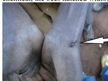
Poorly developed wing unable to fly

For example, according to the survey result in Daro Labu, the chemical used by Flora Eco-power alone caused on average total loss of 2.22 colonies and weakened 3.51 colonies per beekeepers. Even a year after the use of the chemical, the bees hatched without wing or deformed; which may be due to the residual effect.