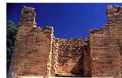
Temple at Yeha

It is very complex to suggest when indigenous education started in most of Africa countries. This is because of lack of written language, devastative warfare and deprived advocacy of funding organization in the areas. In Ethiopia, Monastic and Church education system started in Aksumite period following the introduction of Christianity about the 4th century A.D. Aksum was a powerful kingdom in the Horn of Africa, they dominated vast territories up to south Arabia and control the major trade routes. However, its evolvement in Christian based traditional monastic education in a very organized way started on the 13th century A.D when the literature of the church had reached its peak (Hailegebriel, 1970) following the coming of the Nine Saints from Middle Eastern countries and strong support of Solomonid dynasty to christianity. At the beginning of the 4 th century A.D., the church became a formal indigenous institution i.e. the only schools in the country that constituted traditional culture, religion and provided education which makes people read and write in Geez. Among the prominent monastic schools “Yeha” and “Debra Damo” in Tigray became great church schools of learning. Later speade to “Haiqe” and central part of the provice of the shewan kingdom