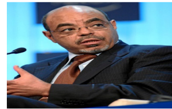
Meles Zenawi, Prime Minister of Ethiopia

When a change of government had taken place in May 1991, a reform has automatically begun. Peace, stability, democratization, and liberalization of the economy were some of the changes considered by the Transitional Government of Ethiopia. Education was one of the areas that the reform focused on. Two major policy guidelines were in place: a) a policy guideline produced based on the Charter adopted by the 'Conference for Peace and Democracy' in 1991, and b) The Education and Training Policy adopted in 1994.