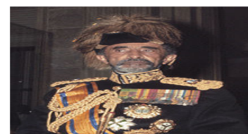
Haile Selassie I Emperor of Ethiopia