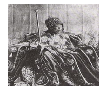
Menelik –II-Emperor of Ethiopia

Ethiopia one of the few African countries never to lose its independence, Ethiopia is as large as the combination of France and Spain and has one of the richest histories, culture, written language, diversity and identity on the African continent. However, until the opening of Menelik –II- School in Addis Ababa in 1908, there was no government (public) schools or education system in Ethiopia. Emperor Menelik was the father of modernization in Ethiopian history. In fact, there was an attempt to provide modern education through missionaries (Catholic missionary, Jesuits) during the 16 th century A.D