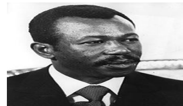
Mengistu Haile Mariam Chairman of the Derg and Head of State of Ethiopia

The events of 1974 led to the downfall of the 44 years Haileselassie imperial regime and its replacement a radical military group known as Derg. This has led the country into unquestionably revolutionary situation in Education, Agriculture, trade, etc. The major changes include the overthrow of an ancient and well-established monarchy; the nationalization of all-major means of production, urban and rural; the nationalization of urban land and rented housing; the creation of the new constitutional system on Marxist-Leninist lines, and a reversal of diplomatic and military alliances from the USA to USSR.