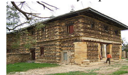
The church of Debra Damo