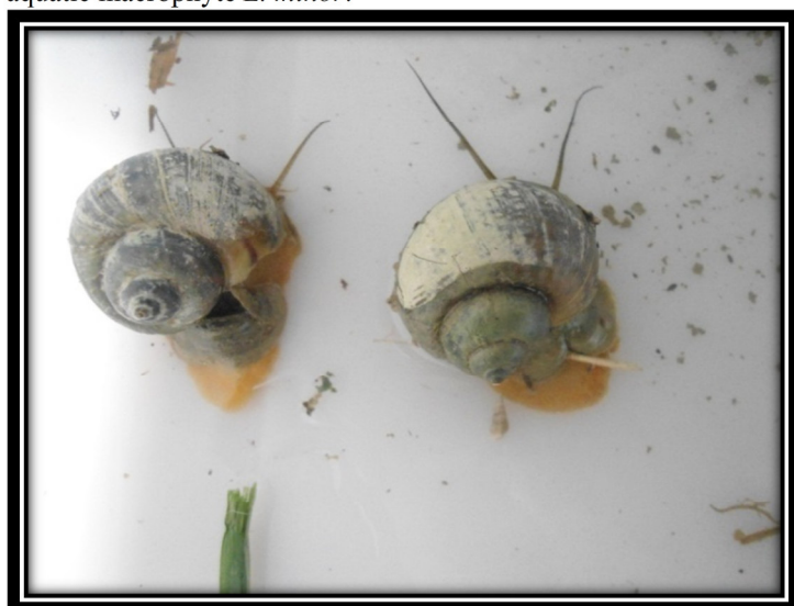
Picture 1. Its image represents the snail during the experiment in the laboratory

Thus, it is concluded that P. canaliculata has potential for use as a biocontrol organism of submerged aquatic macrophyte L. minor .