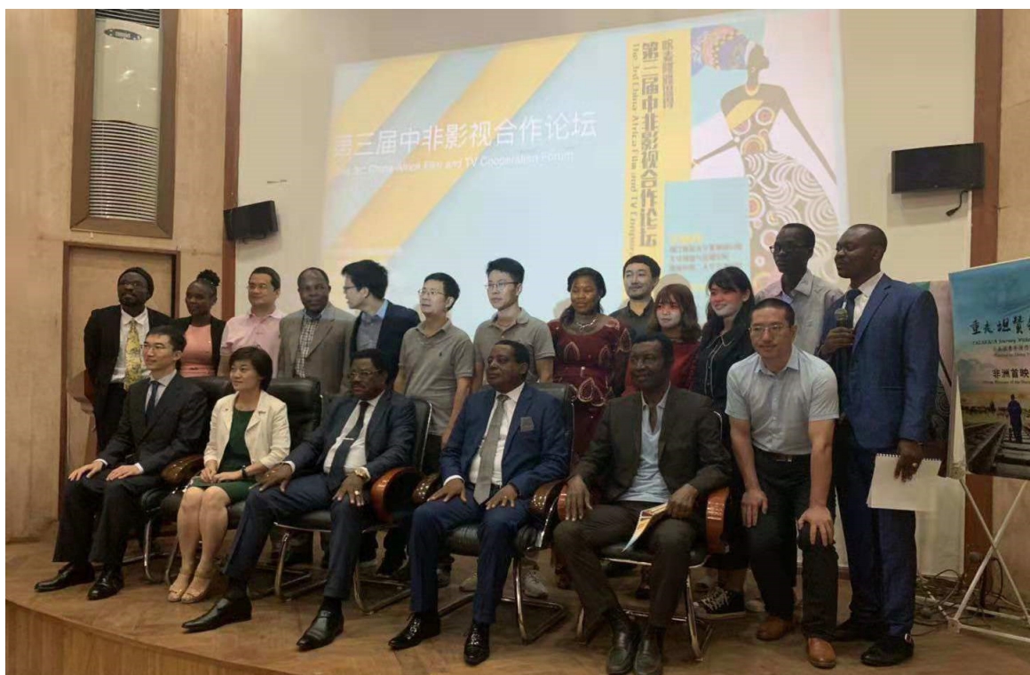
Figure7. Family photo of Chinese and African Scholars and Chinese-Cameroonian government's officials present at the forum (Author with the microphone as the official host of the forum) Even though lagging behind on Anglophone African countries, these few examples illustrate the will of the Francophone African countries to actively step up education cooperation with China as well.