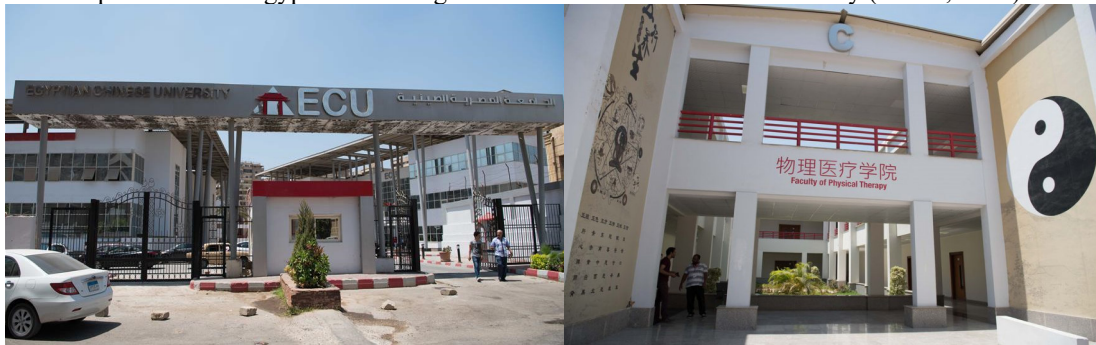
Figure3: Egyptian Chinese University (ECU)

It is to be noticed Egypt is the very first Africa country to sign diplomatic ties with the new China in 1957, and one of the strategic country of the BRI initiative, and also that historically, the first Africans to set boots in China were Egyptian acrobats in 112 B.C. “Egypt has always been in the frontline of playing a leadership role on the Continent, and taking its responsibility as old Civilization”. Just as mentioned Ashraf el-Shihy, the ECU president in an interview with Xinhua News, a Chinese State-run journal, he further stressed that “China is not just a country, but it is a very big industrial and trade power. The ECU is a result of the natural approach between the oldest two civilizations in history: Egypt and China. (...) The ECU is the first and only one of its kind in the Middle East and Africa...The total number of ECU students so far is about 2,500. We care for providing high-quality education than having a large number of students, which is why our classrooms are small but so many” said the ECU president and Egypt’s former higher education minister Ashraf el-Shihy (Yurou, 2019).