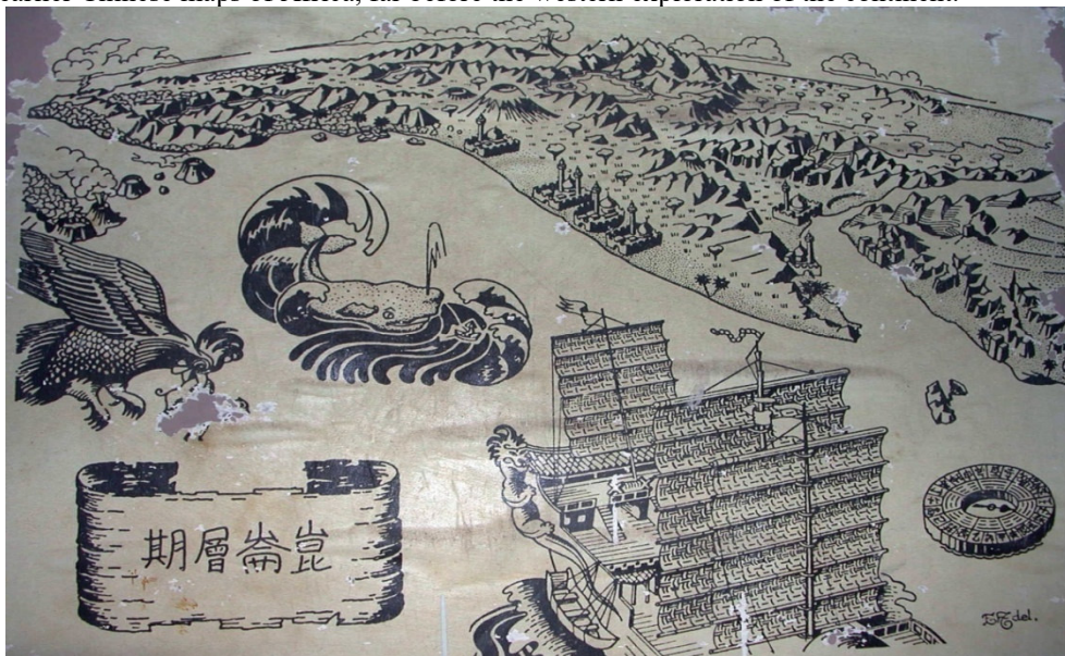
Figure1. Map of earliest Chinese Navigator Sailing the East African Waters

Africa is known to be the origin of Mankind, and together with China both are cradles of human civilizations with long histories and splendid cultures. The “Study” of each other can be traced back to a distant past as suggest records of early contact between China and Africa. In fact, there is a record of African Acrobats visiting China as early as at the 2nd Century B.C. while already in 1405-1433, the Ming dynasty, in the Chinese navigator Zheng He sailed westward through the Indian Ocean and beyond for seven times, out of which he reached the African coast four times. (Source: Assistant foreign minister of the People’s Republic of China, Zhai Jun 2009). Even though ancient academic or intellectual exchanges between both sides are not clearly mapped out, still they are claims of earlier Chinese maps of Africa, far before the western exploration of the continent.