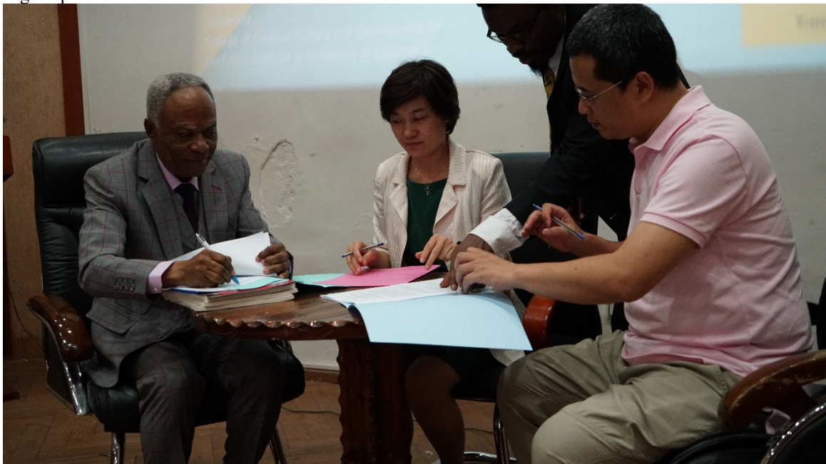
Figure6. Cooperation Agreement was signed between the University of Yaoundé II of Cameroon and Zhejiang Normal University of China

research programs between our Chinese and Cameroonian Universities in the field of Cinema, the Co-direction of Sino-Cameroonian movies as well as the active participation of Cameroonian movies in Chinese movies festivals and vice versa, the establishment of Sino-African movie festivals were experts on both sides could gather and exchange experience.