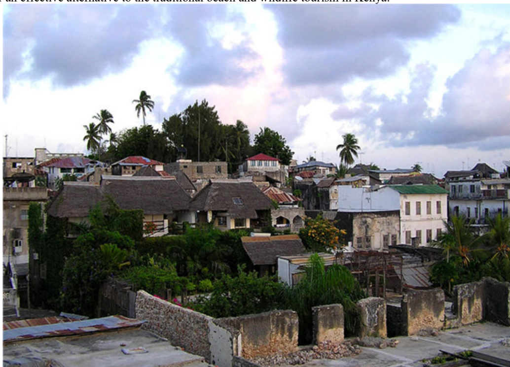
Figure 2. Lamu Old Town (Chantal, 2018)