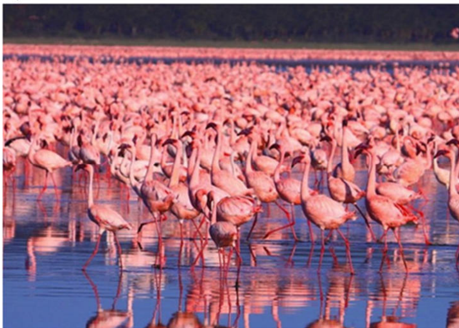
Figure 1. Lake Nakuru National Park.

Kenya is endowed with many tourist attraction resources including the ocean and lake beaches in Mombasa, Lamu, Malindi, and Kisumu, deserts (Chalbi and Nyiri), beautiful rain forests like Kakamega forest, grasslands, coral reefs at the Coast, islands like Mfangano, The Great Rift Valley, beautiful tribal cultures among others. The majority of these natural resources aren't utilized for international tourism except for the beaches on the Coast of Kenya. Besides this, wildlife continues to be a major tourist attraction in Kenya. According to World-Bank (2010), besides the big five animals, Kenya has more than 500 and 359 birds and animal species in a 47,674 square kilometers pieces of land of national parks, game reserves, wildlife sanctuaries and wildlife conservancies spread across the country. There is however underutilization of these resources as most of them in the rural areas are not marketed and therefore attract few tourists as 80% of the tourists do visit 7 parks only, therefore leaving all the other parks and reserves underutilized (GOK, 2017; World-Bank, 2010). With large bird species, Kenya has the potential to be a tourist destination for bird watchers and trekking activities around Mount Kenya. Flamingos, shown in figure 2, have attracted a significant number of tourists to Kenya being an important tourist attraction in Nakuru County.