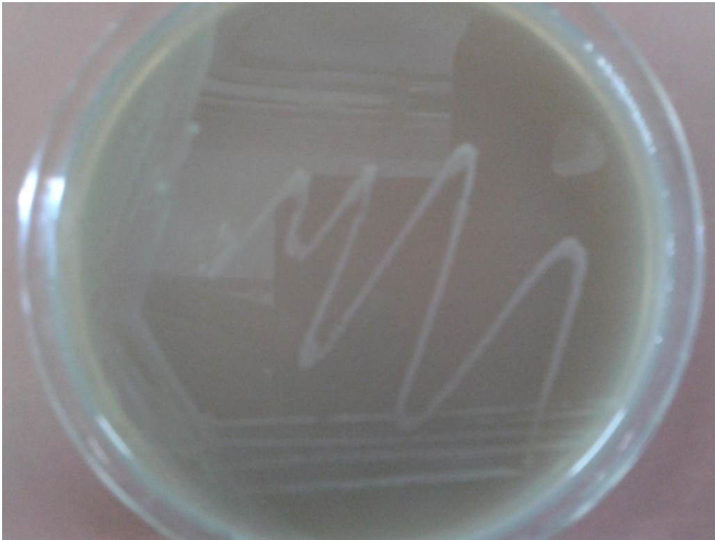
[Figure 4]: White colonies of Candida albicans on eggplant leaves agar.