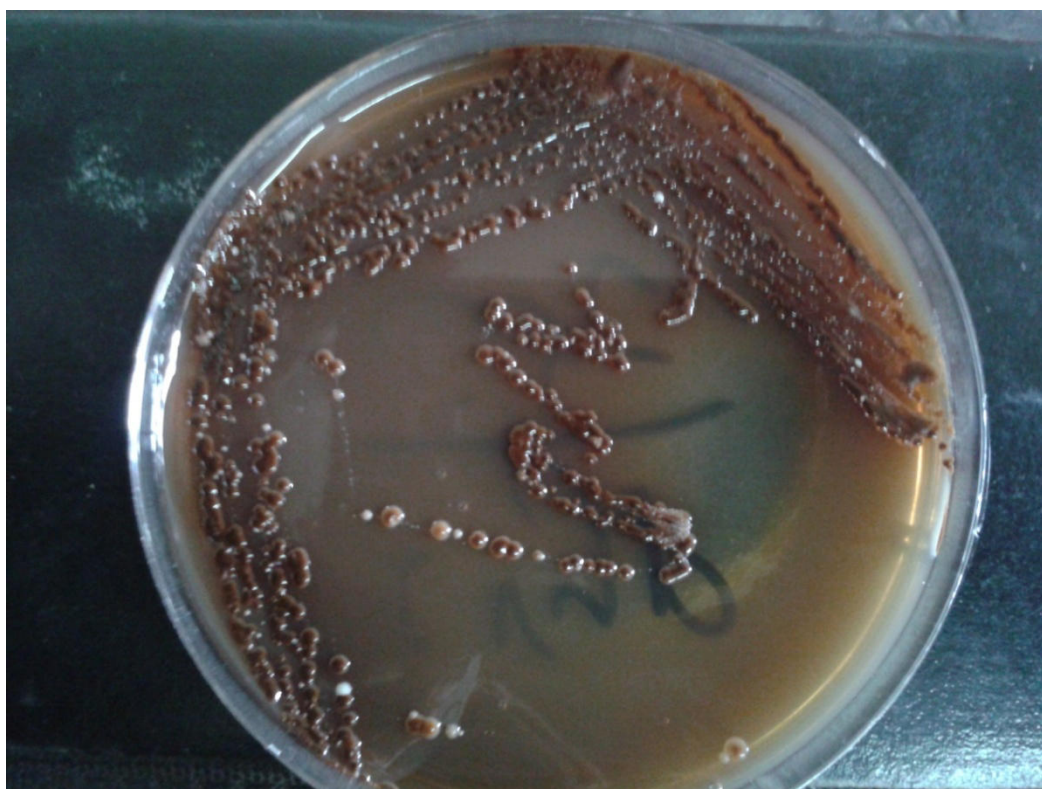
[Figure 1]: Brown pigment of Cryptococcus neoformans on apple leaves agar