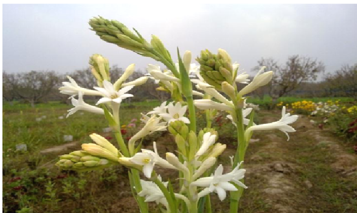
3. Cut Tuberose Flowers