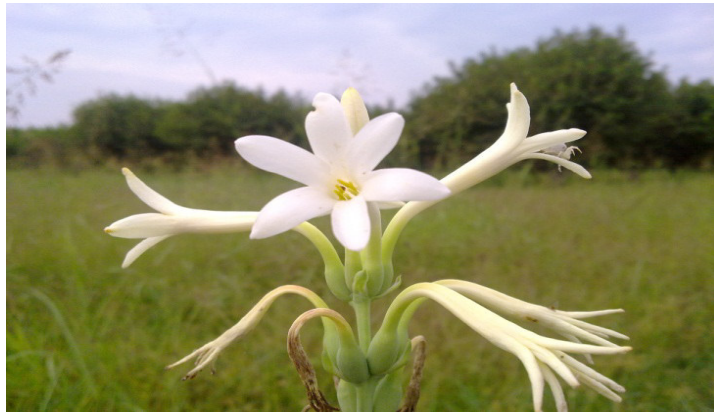
2. Last Floret Opening