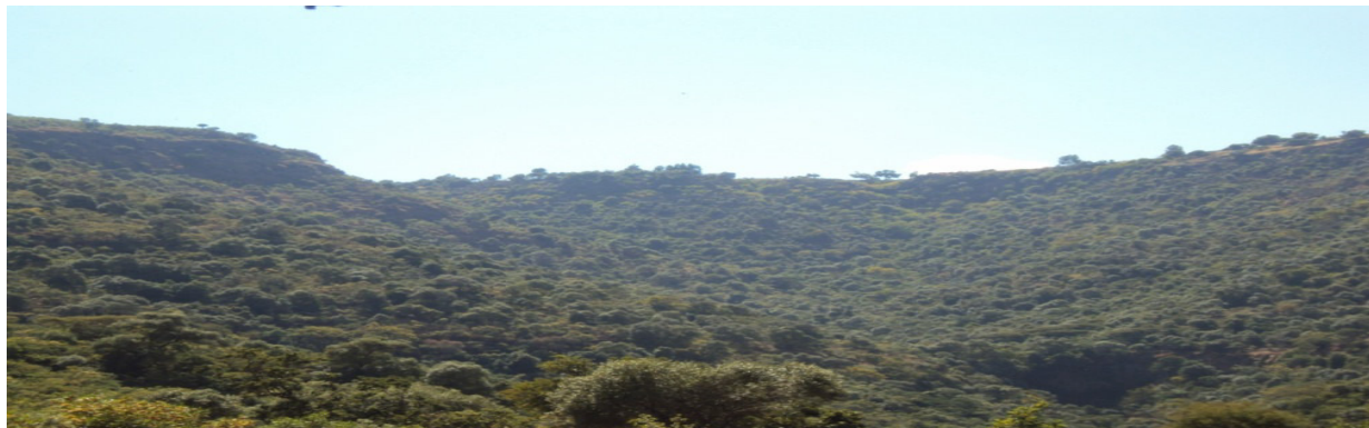
Figure 3: Part of protected area