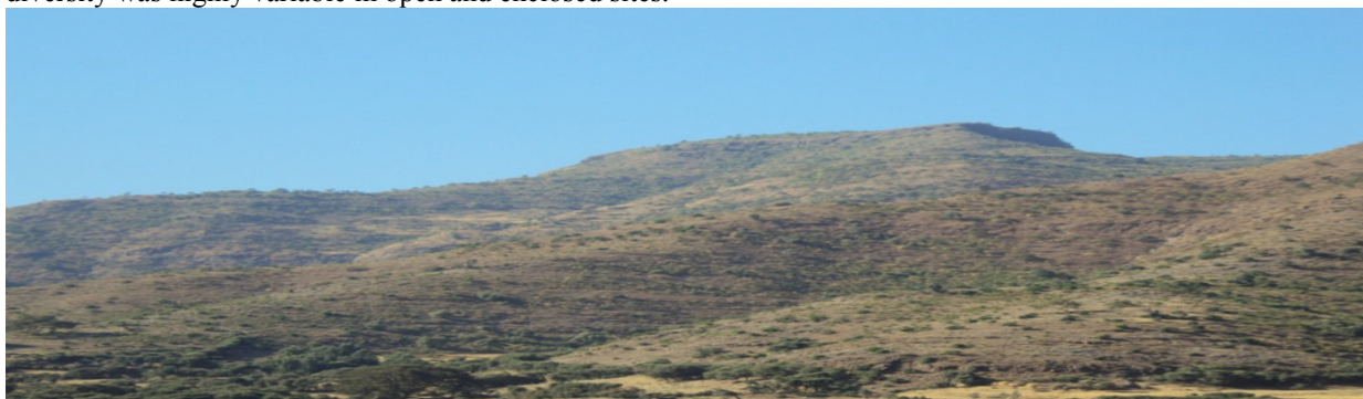
Figure 2: Part of open sites

Agriculture is the major economic activity in the district and the country at large which is characterized by rain-fed and predominantly subsistence nature. As a result, most woody plants have been destroyed due to the expansion of agricultural lands by the growing population. Some of the existing remnant forests were mainly found around the mountain ridges, steep slopes, churches and in enclosure areas. Among these Adey Amba is part of an enclosure have high plant species varieties. After the establishment of enclosure and protected from human and livestock interference, it is now becoming rich in plant species diversity. The dominant tree species currently seen in the enclosure were Olea europaeana subsp. cuspidata , Combretum molle , Allophylus abyssinicus , Acokanthera schimperi , Acacia seyal and Croton macrostachyus and the shrub species were Dodonaea angustifolia , Calpurnaea aurea , Euclea schimperi , Phyllanthus ovalifolius and Carisa edulis , but diversity was highly variable in open and enclosed sites.