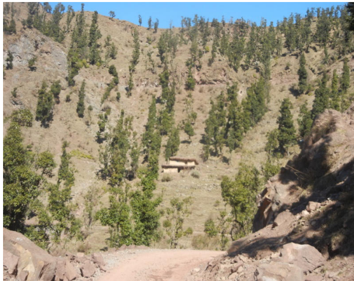
Figure 4 A degraded oak forest in the study area(village Badhal (Kotranka))