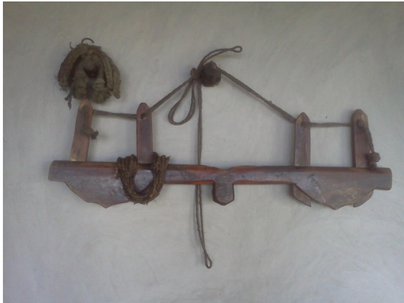
Figure 3 A yoke (a farm tool used with plough) made of Quercus leucotrichophora