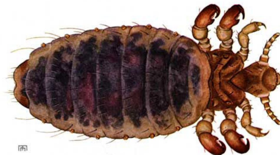
Figure 1. Adult little blue cattle louse, Solenopotes capillatus (Enderlein). Illustration by Ellen Edmonson, Cornell University Agricultural Experiment Station, Bulletin No. 832. Used with permission.

Of the five sucking lice that feed on cattle in Florida (Kaufman et al. 2007), Solenopotes capillatus (Enderlein) is the smallest in size (Grubbs et al. 2007). The little blue cattle louse, as it is commonly called, is in the family Linognathidae (the pale lice) and is one of the nine currently recognized species in the genus Solenopotes (Durden and Musser 1994).