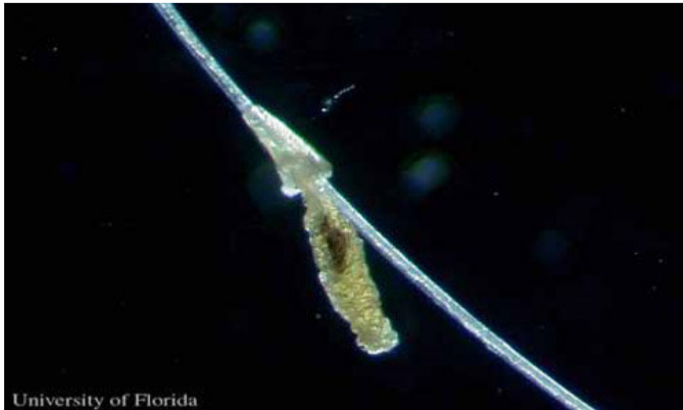
Figure 2. Egg of the little blue cattle louse, Solenopotes capillatus (Enderlein), cemented to a hair.

Eggs: The female louse lays one to two 0.7 mm eggs per day, each attached to a hair. Often the hair is bent, a feature not observed with other cattle lice.