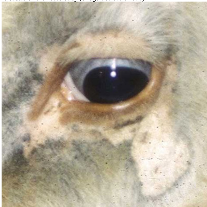
Figure 5. Infestation of the little blue cattle louse, Solenopotes capillatus (Enderlein), around the eye of a cow.

Solenopotes capillatus is a small louse, often confused with Linognathus vituli nymphs (Matthysse 1946), that feeds on the head, primarily the face and jaw regions, with sporadic occurrences on other body regions (Watson et al. 1997) of domestic livestock and captive ungulates. Once an individual establishes itself on a host, it rarely relocates on the host's body (Skogerboe et al. 2000).