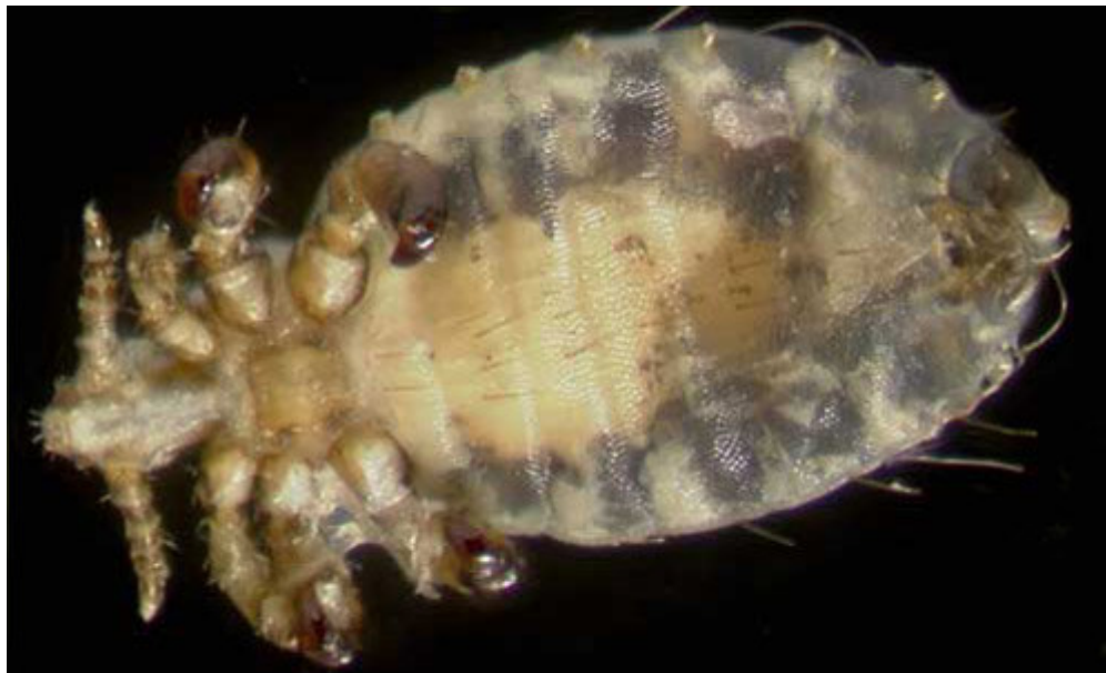
Figure 4. Ventral view of an adult little blue cattle louse, Solenopotes capillatus (Enderlein).