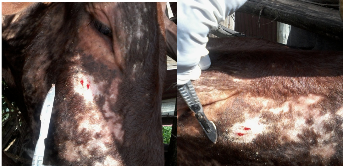
Figure 3: Procedures of sample collection (skin scarping)