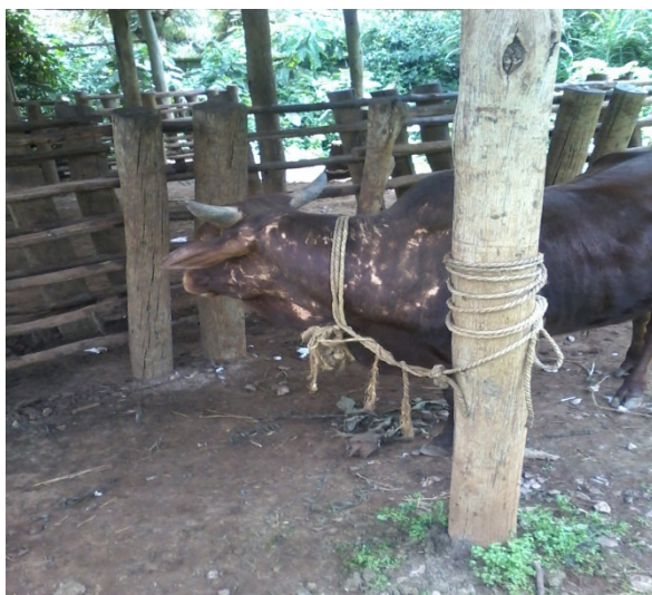
Figure 2: Alopecia as a consequence of frequent itching