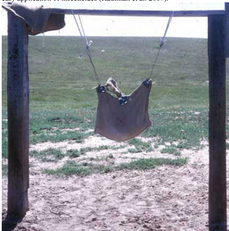
Figure 6. Dust bag used to apply insecticides to cows.

Chemical control. Chemical treatments, including pour-on and dip insecticides, have historically been the primary method of louse control on cattle (Townsend 2000, Kaufman et al. 2001, White 2007). Recently, formulations administered subcutaneously have also been shown to be successful at treating lice (Cleale et al. 2004). Many new systemic insecticides require only one treatment for long-term louse control, but organophosphates and pyrethroids require two applications (Townsend 2000). Some formulations of pyrethroids and avermectin derivative-type treatments are the current recommendations for control of lice on lactating dairy cattle (Nafstad and Grønstøl 2001). Dust bags placed in locations where the cattle are forced to use them provide easy application of insecticides (Kaufman et al. 2007).