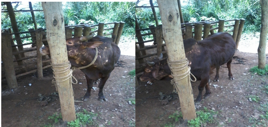
Figure 1: Rubbing against post and opening mouth to express the presence of itching

non-parasitic disease and treated it with oxytetracycline. While the first author was passing through the clinic he observed the animal rubbing itself against a post in the clinic and opened its mouth from a distant ( Fig.1 ). Up on clinical examination, the animal was found to have itching, alopecia on head and neck ( Fig.2 ). On detail examination of the animal for external parasites, the authors realized the presence of lice on the above indicated sites with rough scruffy coat appearance around the infested area, presence of aggregated many small sized blue to black colored lice on the neck, face and head region of the animal and a sample of skin scraping was taken for identification of the species of the lice ( Fig.3 ). Up on skin scraping examination, many nits, nymphs and blood full adult lice were examined under stereo-microscope. The finding was consulted with Wall and Shearer (2001) and identified to be Solenoptes capillatus .