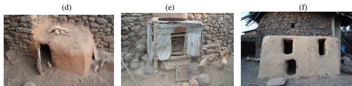
d= wooden cemented with mud, e= iron sheet type, f= mason type