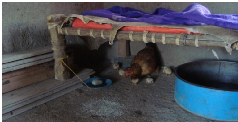
Figure 1. New hatched chicks reared beneath family bed in the lowland.

The key informants in the group discussion pointed out that the provision of injera to lying hens may lead them to deposit more fat and eventually cause to cease laying egg but for growers it is required to achieve fast growth rate.