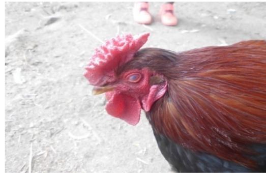
Rose comb type