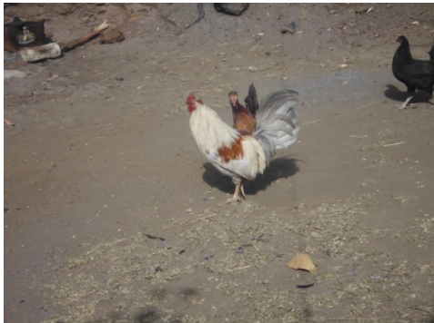
Kuarichama (sendekma) male