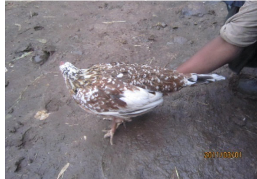
Key teteruma female