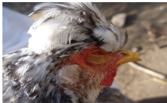
Crest ('gutena') head