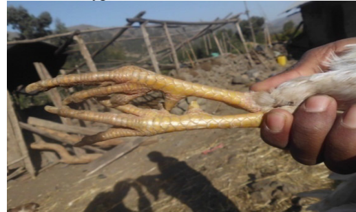
Yellow shank color