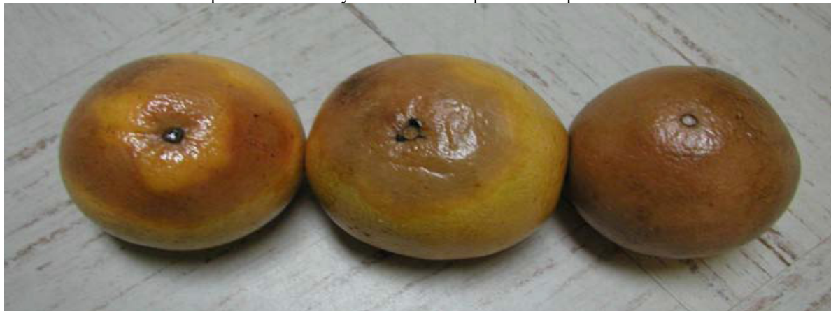
Phomopsis stem-end rot

The fungus grows on tree deadwood, where it produces spores that spread by water to immature fruit during rainfall or irrigation. Infection of the young fruit produces small pustules. The fungus also becomes established in dead tissue of the button, where it lays dormant until harvest. As the button deteriorates during storage, the fungus grows from the surface into the base of the fruit through natural openings that occur in the abscission zone. Decay progresses evenly through the rind and core until the entire fruit is completely rotted, with no spread to adjacent fruit. This type of stem-end rot is dark to light brown in color and more prevalent in late-season non-degreened or cold storage fruit of all types. Ethylene degreening has no effect on Phomopsis stem-end rot. It is a serious post-harvest decay in humid subtropical and tropical areas.