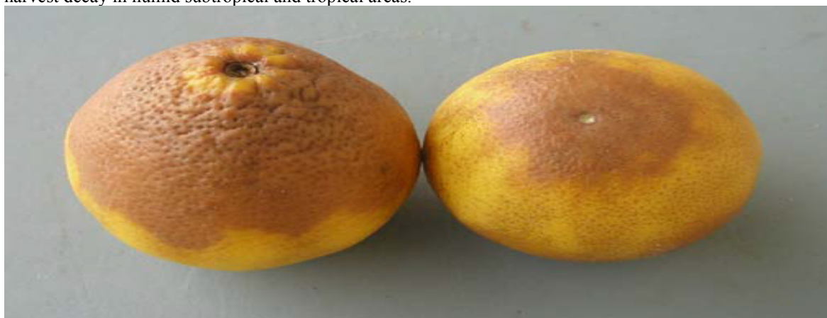
Diplodia stem-end rot

D. natalensis is a saprophyte that completes its life cycle on deadwood of citrus trees in grove. Water transmits fungal spores from deadwood to the surfaces of immature fruit where the fungus colonizes dead tissue of the button (calyx and disk). These fungal colonization remains latent and does not cause fruit decay before harvest. Infections develop after harvest especially under conditions of high temperature and relative humidity. The pathogen usually infects fruit from the button at the stem-end of the fruit. It proceeds through the core more quickly than the rind, leading to development of soft brown to black decay symptoms at both ends of the fruit. The pathogen usually develops unevenly in the rind, forming finger-like projections of black to brown discolorations at the lesion margin between the segments. Decay develops rapidly during and after excessive degreening and can be observed in fruit at the packinghouse. It is often observed at market arrival or shortly thereafter. This decay does not spread from infected fruit to healthy fruit in packed cartons. It is a serious post-harvest decay in humid subtropical and tropical areas.