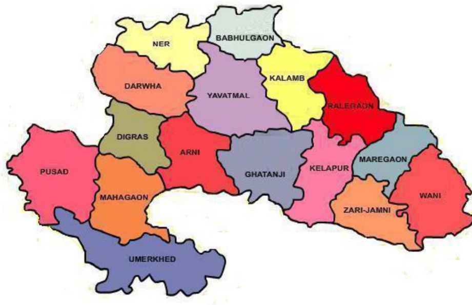
Fig 1- Taluka-wise clustering of Cholera cases