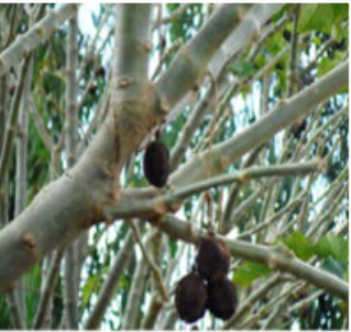
Fig 4: Dried fruits of J. Curcas L. (Mubonderi, 2012)