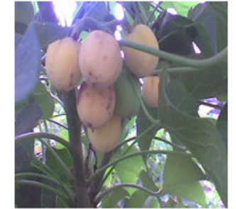
Fig 3: J. curcas L with ripen fruits