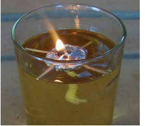
Figure 11a): Oil lamp extracted from jatropha oil

(Brittaine, 2010). It can also be used as an illuminant in lamps as it burns without emitting too much smoke.