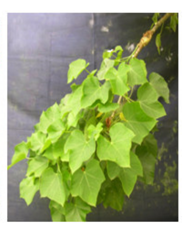
Fig5c) Propagation of J. curcas by air layering techniques

Fig 5a) Propagation of J. curcas by stem cutting