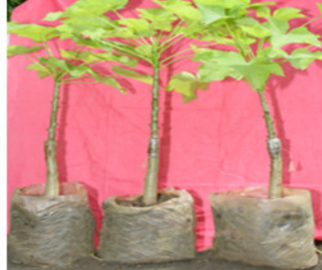
Fig 5b) Propagation of