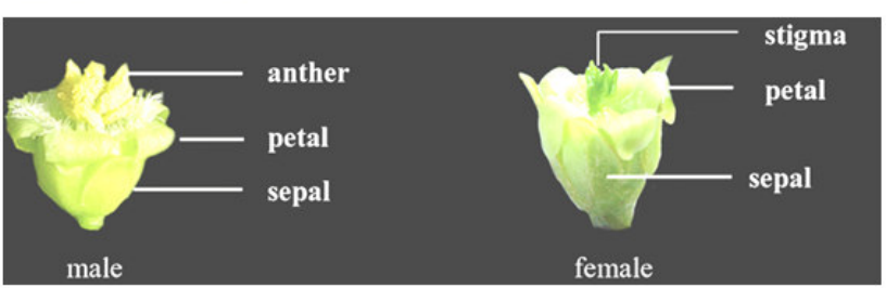
Figure 1: Flower of J. curcas L.; Sources: (Lozano, 2007) and DEGJSP, 2012