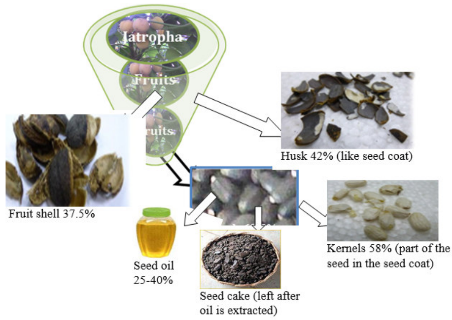
Fig 8: Harvested fruits products of J. curcas L. and their fractions by weight. Sources Abreu (2008), Deng et al. , 2010 and Lim et al. , 2014 a

Malaysian J. curcas seed kernels using Hexane. High oil content of J. curcas indicated the plant is suitable as non-edible vegetable oil feedstock in oleochemical industries such as biodiesel, fatty acids, soap, fatty nitrogenous derivatives, surfactants and detergents.