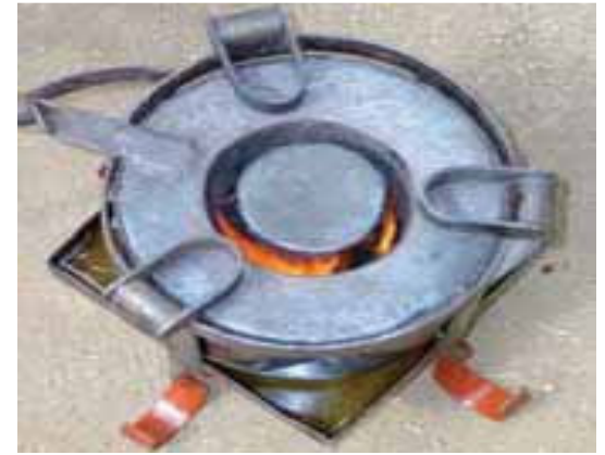
Figure 11 b): special,Kakute stove works by jatropha oil R MAHAJAN - 2009

Cooking fuel: Raw oil can also be used as a substitute for kerosene in lamps and cooking stoves. However, these will need to be modified to account for high oil viscosity and low absorbance capacity (Tomomatsu and Brent, 2007). There are clear advantages to use plant oil instead of traditional biomass for cooking. These include health benefits from reduced smoke inhalation, and environmental benefits from avoiding the loss of forest cover and lower harmful Green House Gas, GHG, emissions, particularly carbon monoxide and nitrogen oxides. The high viscosity of jatropha oil compared to kerosene presents a problem that necessitates a specially designed stove. In Zimbabwe, Mutoko district, Kakute, an NGO provided out-grower farmers with cooking stoves called 'Kakute stove' that uses jatropha oil and it proved to be beneficial to local people (Van Eijck and Romijn, 2008; Marjolein and Romijn, 2010).