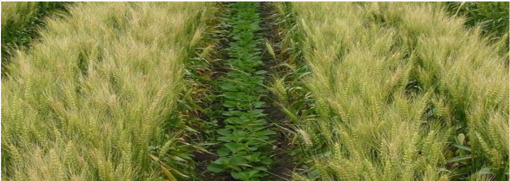
Fig. intercropping wheat with leguminous crops

of direct transfer of N m a maize/cowpea intercrop it is believed that N benef1ts of these systems may accrue more to subsequent crops after root and nodule senescence and decomposition of fallen leaves. It is generally known that soil conditions, such as P, Ca and Mo deficIencles, Al and Mn tox1c1tles, and drought stress are limiting factors for N2 fixation.