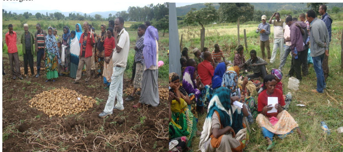
Figure 3: Participants on field day to select Irish Potato through their own criteria's.

good color, high yielder and good taste while eating varieties. The rest varieties (Toluma, Bete and Local) were attack by late blight and bacterial wilt and perishables, low yielder as compared to selected varieties. Gudane and Bubu varieties were selected and ranked by participants for further scaling up and multiplication on their agro-ecologies.