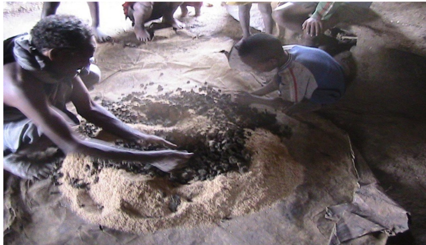
Figure 3.2: Mixing of local dried brewery residues (locally known as atela ) and rice bran fed to fattening at farmers' door

Average daily BW gains were calculated as the difference between final BW and initial BW divided by number of feeding days. The feed conversion efficiency of experimental animals was determined by dividing the average daily BW gain to the amount of feed consumed.