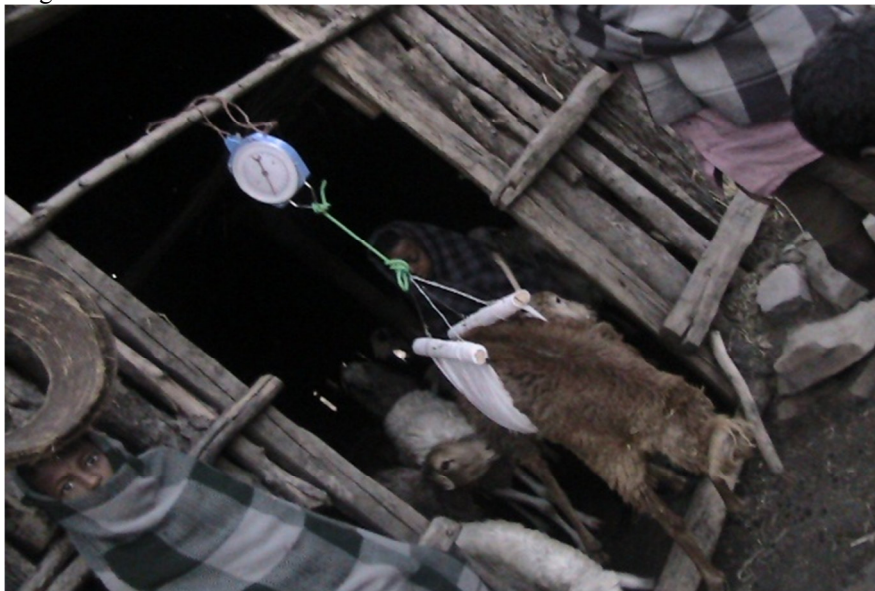
Figure 3.3: Body weight measurements by using weight balance

Average daily BW gains were calculated as the difference between final BW and initial BW divided by number of feeding days. The feed conversion efficiency of experimental animals was determined by dividing the average daily BW gain to the amount of feed consumed.