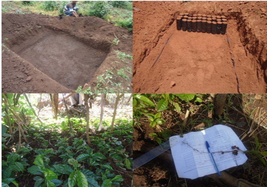
Figure 3. Sunken bed preparation of dry nursery management at Daro Labu and Habro districts