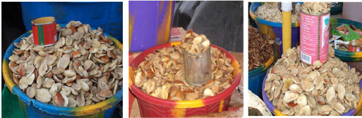
Fig. 2: Irvingia nuts displayed for sale in a typical market in Yenagoa metropolis of Bayelsa State, Nigeria