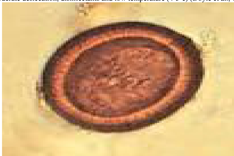
Figure4: The egg of Taenia saginata

Eggs passed in feces or discharged from ruptured gravid segments are sub spherical to spherical in shape. The egg consists of the hexacanth (6-hooked) embryo (oncosphere) thick dark brown to yellow in color. There is an outer oval membranous coat, the true egg shell, which is lost in fecal eggs (Harrison and Sewell, 1991; Brown and Neva, 1983). It measures 30-41 micrometers in diameter and 46 to 50 micrometers in length (Soulsby, 1982; O I E., 2000). The eggs survive up to 200 days in moist manure, 33 days in river water, 154 days on pasture and are resistant to moderate desiccation, disinfectants and low temperature (4-5 0 c) (Doyle et al. , 1997).