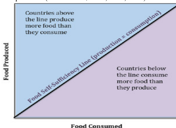
Figure 1: Basic representation of food self-sufficiency

More precise measurements of the SSR also include changes in domestic stock levels (Puma et al. , 2015; FAO, 2016). The SSR is typically measured in calories or in volume of food produced, although it can also be expressed as a ratio of monetary value. Another measure that captures self-sufficiency levels of countries focuses on dietary energy production (DEP) per capita within a country. This measure considers those countries that produce over 2500 kcal per capita per day to be self-sufficient as it is over this threshold that caloric intake is deemed to be required for an adequate diet (Porkka et al. , 2013; FAO, 2016).