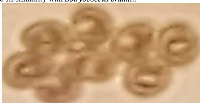
Figure 2: Image of the Botryococcus braunii snapped using digital camera under the microscope after two weeks growth period

Pure Botryococcus braunii species colonies were found in the serially diluted tubes numbered 10^{-7} and 10^{-8} after four week's growth period. The algal species were seen in colony and the individual cells of the colonies were in the range of 3 - 11 \mu\text{m} and the colonies were found to be between 25 - 150 \mu\text{m} . Cells were spherical in shape and the colonies remain attached to one another. Cells are generally green to yellowish green in color. Similar observations were made by Chandra in Miocene lignites of Kerala, India (Chandra 1964). Botryococcus braunii is a colonial green micro alga distributed on all the continents in fresh water, brackish water, Saline lakes, reservoirs and small ponds (Aaronson et al., 1983). Botryococcus braunii were mainly distinguished based on colony size and details of cell shape, therefore The Colony characteristics and morphological features of the isolate have demonstrated its similarity with Botryococcus braunii .