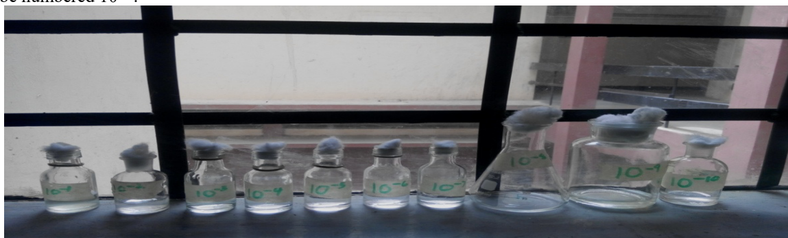
Figure 1: Serially diluted algal culture

9ml of CHU-10 Media was poured into ten test tubes numbered 10^{-1} , 10^{-2} , 10^{-3} .... 10^{-10} . From the water sample 1ml was collected and poured into the test tube numbered 10^{-1} , 1ml was then collected from the test tube numbered 10^{-1} and was poured into the test tube numbered 10^{-2} , the processes was continued up to the last test tube numbered 10^{-10} .