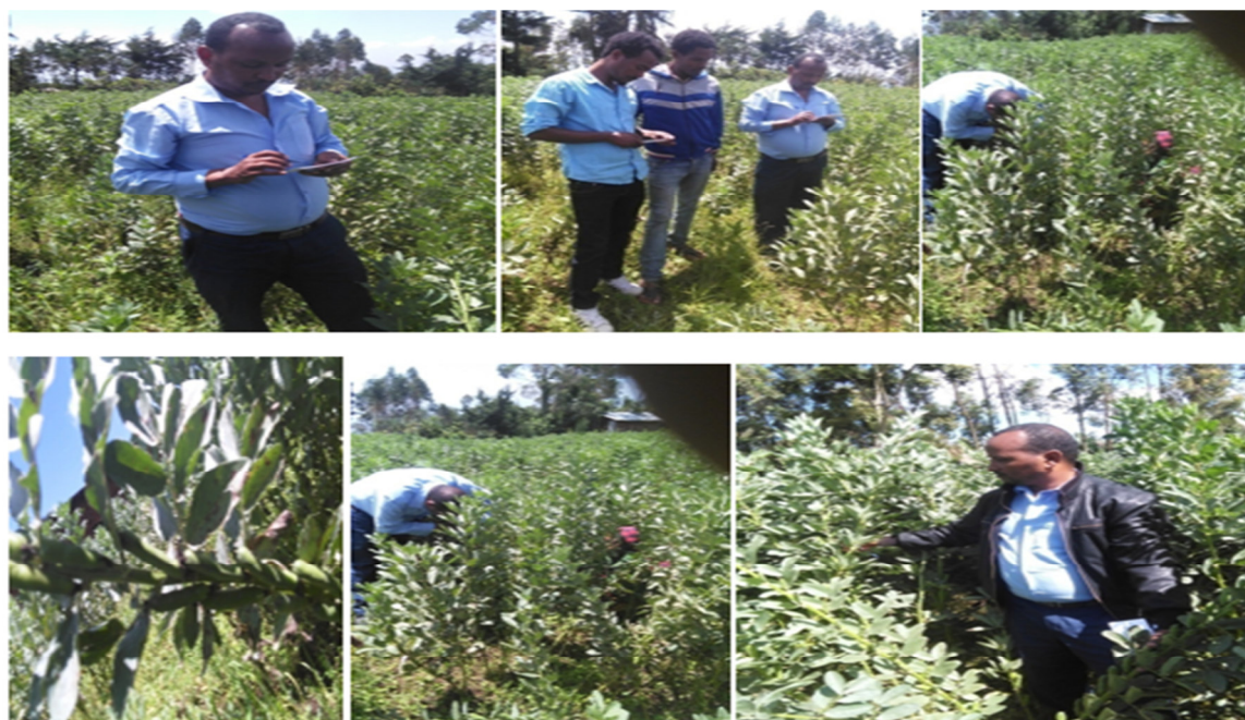
Fig 3. Tembaro Site Faba bean picture