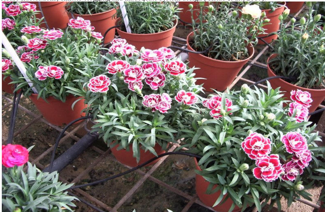
Figure 2. Drip pipe irrigation system in pots in Dianthus caryophyllus .

Howell (2003) and Irmak et al. (2011) demonstrated the attainable application efficiencies for different irrigation methods, assuming irrigations are applied to meet the crops’ water demands. Micro irrigation Has the potential to accomplish the highest uniformity (90%) in water applied to each plant, yet poor Uniformity and application efficiency can result from various causes, e.g., inadequate maintenance, Low inlet pressure or pressure fluctuations, emitter clogging and inadequate system design ( Hsiao et al. , 2007).