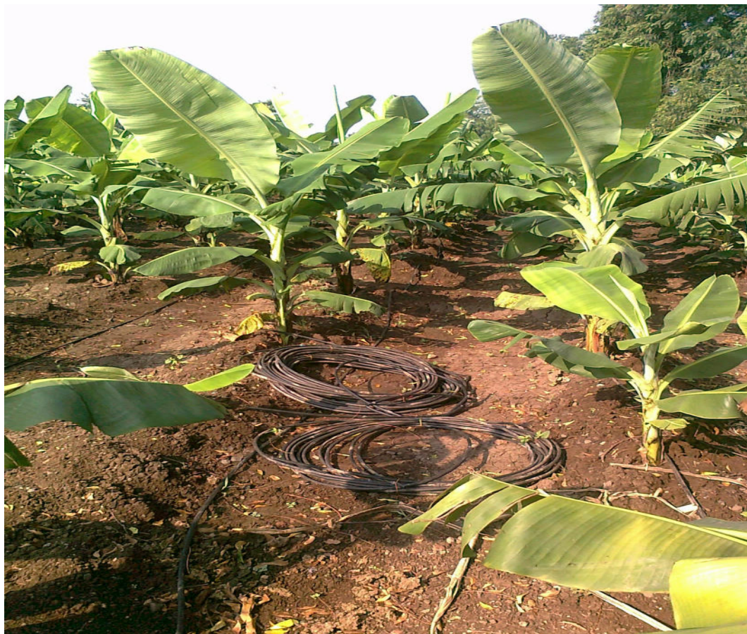
Figure 1. A type of Banana Drip pipe Irrigation system.