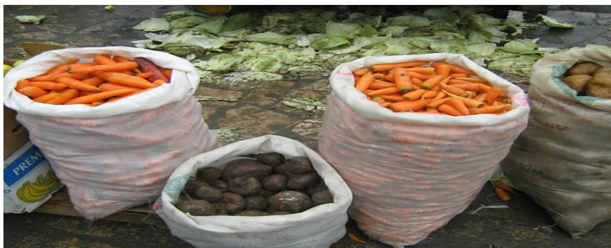
Figure 1. Inappropriate packaging