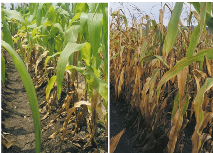
Figure 2 Leaf senescence under N stress. Genotype at left side selected under Low N condition (Benziger, 1997)