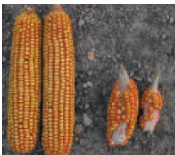
Figure 1 Ears per plant to be selected under Low N. ears at left selected (Below, 2002).

Secondary traits; ears per plant and leaf senescence showed the main discriminated high-yielding genotypes (Benziger and Lafitte, 1997), .picture 2). Prolonged stay green in leaves and deep root contributed for yield increase under Low N condition.