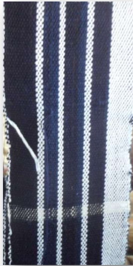
Figure 25: Ketalampe literally means Cowpea