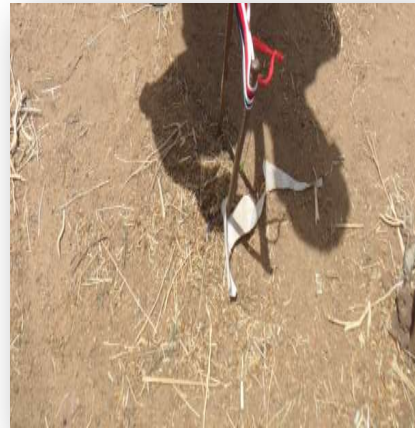
Figure 15: Sambolgo weaver securing crosses