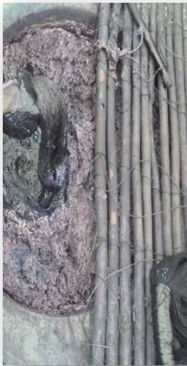
Figure 5: Dyeing in the pit