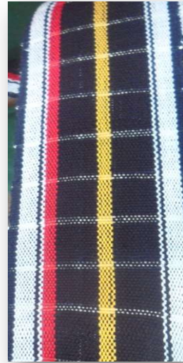
Figure 26: Bu Wulonso literally means 'cover my shame'