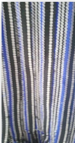
Figure 31: Ganka