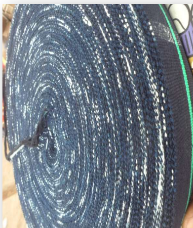
Figure 20: Daboya woven fabric rolled

The weaving processes used by the weavers in Daboya, Sambolgo and Tindamba are almost the same. All the three communities use the three primary motions thus shedding, picking and beat- up. When the required length of the fabric is woven, the warp yarns are cut leaving a small portion in the healds for easy heddling and reeding. The finished strip of fabric is rolled into a circular form (as illustrated in figures 20 to 22) to be sewn together into a larger cloth or for smock. This process is done by all the weavers in the three weaving communities.