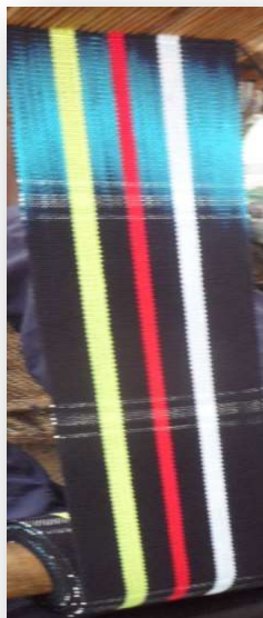
Figure 27: Ewuntoma