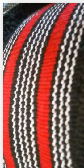
Figure 32: Molisien literally means 'Red cloth'