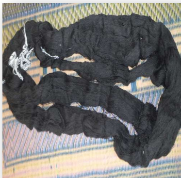
Figure 3: Sambolgo cotton yarns