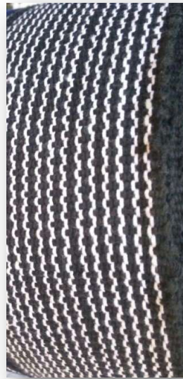
Figure 34: Sangomka