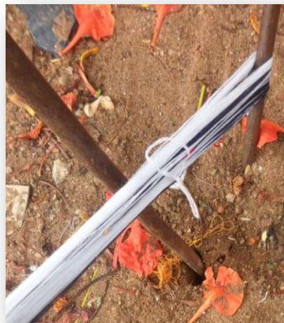
Figure 16: Tindamba weaver securing crosses