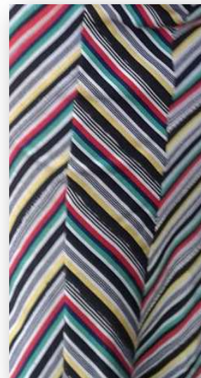
Figure 24: Angelina (named after GTP cloth)