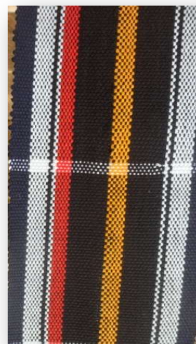
Figure 36: Boolonso literally means 'Don't put me to shame'