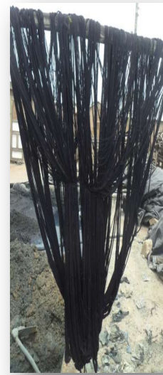
Figure 6 and 7: Drying the dyed yarns