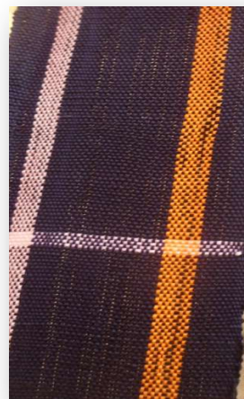
Figure 10: Tindamba fugu fabric

The three samples show the characteristic linear stripes pointed out by Frimpong and Asinyo (2013). The structure of the weave of the fugu fabric in Daboya and Sambolgo are compact due to the number of yarns that pass through the headles and reeds used by the weavers. The uniqueness of the weaving of the fugu fabrics produced at Daboya is seen in the skills exhibited in the dyeing of the yarns before the weavers turn them into fabrics. Most of the fugu fabrics woven at Daboya have blue yarns in them since the indigo plant is mainly used to colour the yarns. Fugu fabrics are woven in simple wooden structured hand looms. The weavers use both hand spun and factory manufactured yarns to produce the fabrics. The quality of a yarn is affected by the fibre that is spun into the yarn.