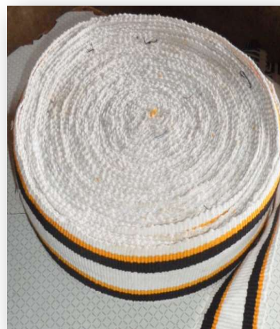
Figure 21: Sambolgo woven fabric rolled