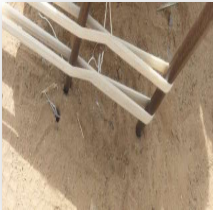
Figure 14: Daboya weaver securing crosses