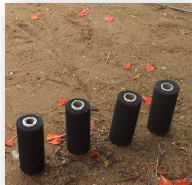
Figure 4: Tindamba cotton yarns

In Daboya, the yarns used are dyed and dried to give the yarns colour and also strengthen them. These treatments give the yarns weight and reduce their breakages during weaving. Figure 5, 6 and 7 show the Daboya dyeing processes.