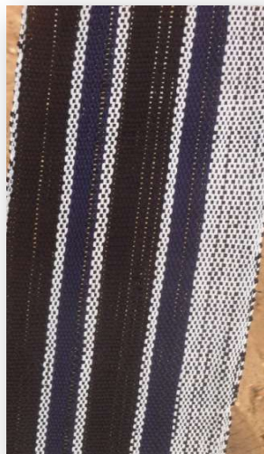
Figure 35: Gbepekleya