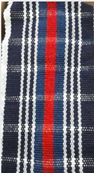
Figure 23: Singbinwura (named after subchief of Wasipewura)