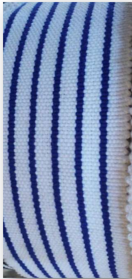
Figure 33: Ayenaba nibemse