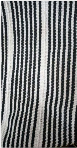
Figure 29: Ayenaba