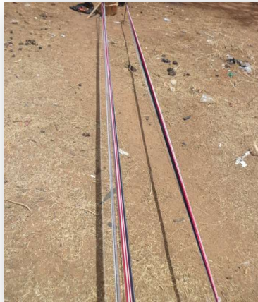
Figure 12: Sambolgo warp preparation