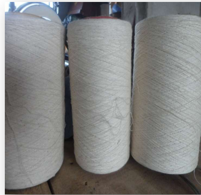
Figure 1 and 2: Daboya cotton yarns