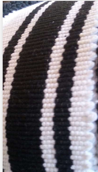
Figure 30: Bogyiagre