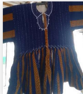
Figure 37 and 38: Colourful fugu (smocks)