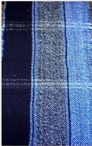
Figure 8: Daboya fugu fabric