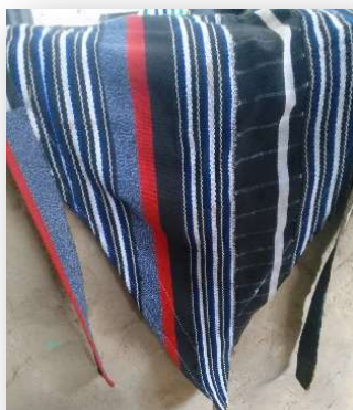
Figure 40: Loin dress