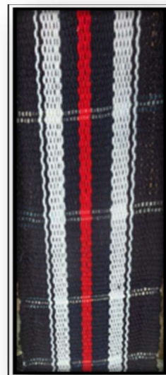
Figure 28: Kanyiti wale literally means 'Patience is good'