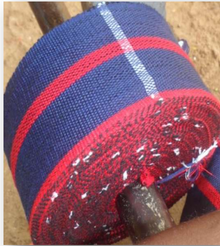
Figure 22: Tindamba rolled woven fabric