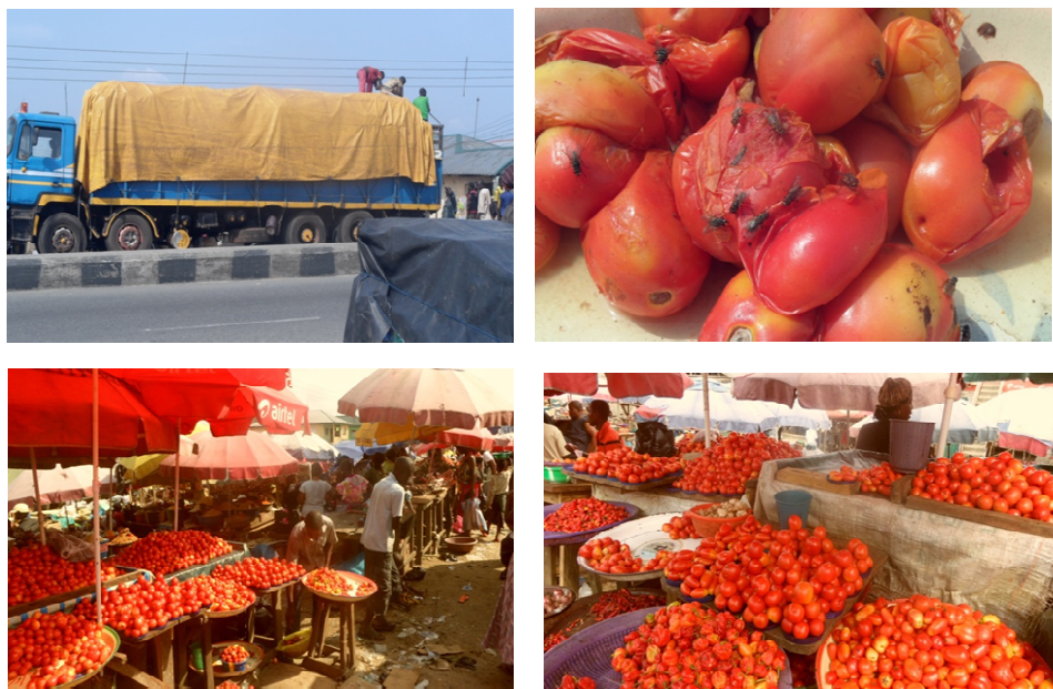
Fig. 2: Transportation and sale of tomato fruits in Yenagoa, Bayelsa State, Nigeria